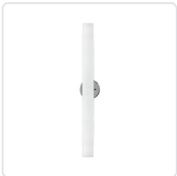
WS8332-BN Brushed Nickel