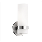
WS9809-BN Brushed Nickel