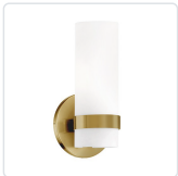
WS9809-BG Brushed Gold