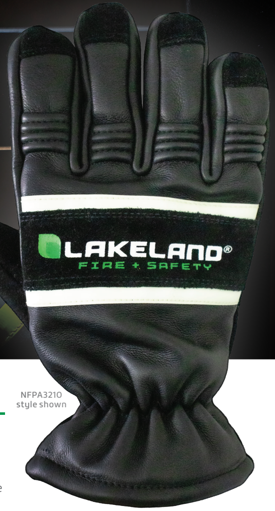
NFPA3210 style shown