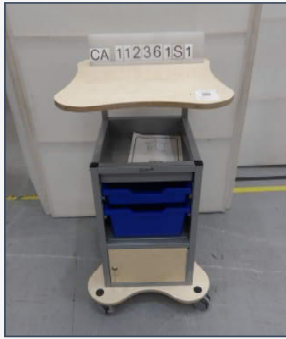
Photo 1 - My Base Tray Unit