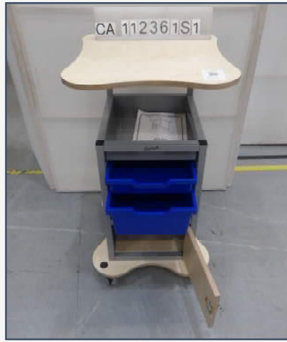
Photo 2 - My Base Tray Unit