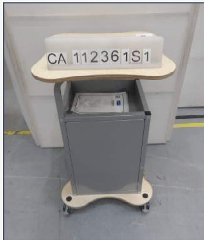
Photo 3 - My Base Tray Unit