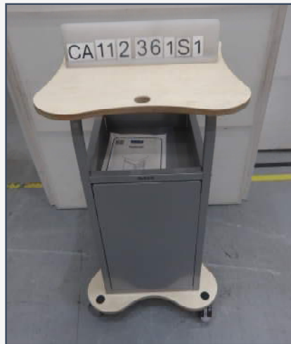
Photo 4 - My Base Tray Unit