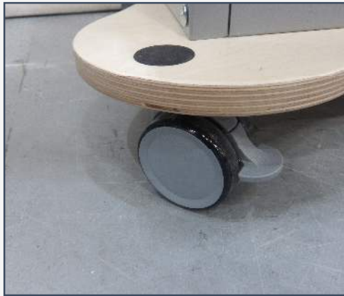
Photo 7 - My Base Tray Unit