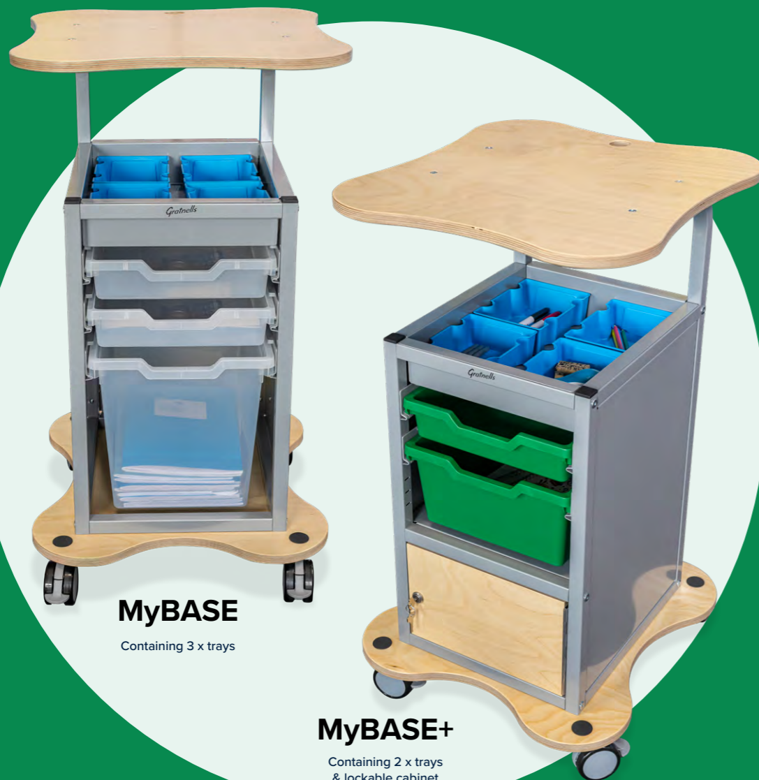
MyBASE Containing 3 x trays