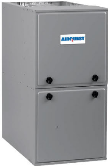
• N9* Gas Furnace (Down/Upflow)