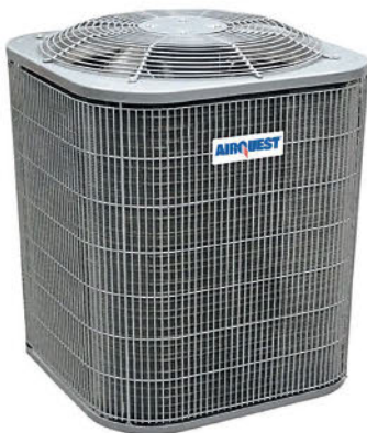
• R5 1.5-5T Condensers

(Furnace, coil box, condenser, coil, and accessories sold separately.)