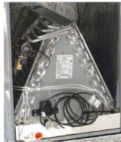
• EAA5X 1.5-5T Indoor Coils