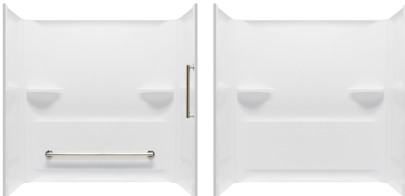
With or Without Grab Bars Grab Bars Sold Separately