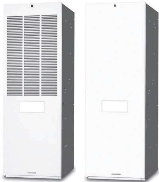
MG2R “A” CABINET

DO NOT DESTROY. PLEASE READ CAREFULLY & KEEP IN A SAFE PLACE FOR FUTURE REFERENCE.