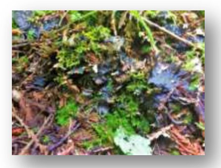
Membranous Pelt Lichen on the forest floor.

Gold Dust Lichen Membranous Pelt Lichen Oak Moss Lichen Old Man's Beard Lichen Ramalina sp. Wrinkled Crust Lichen