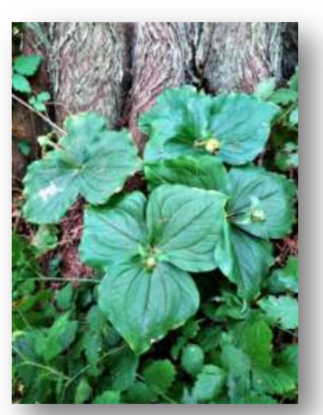
Pacific Trillium was found throughout the mature woods.