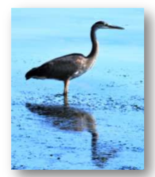
Great Blue Heron fishing in the intertidal zone.

Dark-eyed Junco Glaucous Winged Gull Great Blue Heron Heerman's Gull Mew Gull Pileated Woodpecker Red Tailed Hawk Red-Breasted Nuthatch Song Sparrow Spotted Towhee Swainson's Thrush Red-Legged Frog Banana Slug