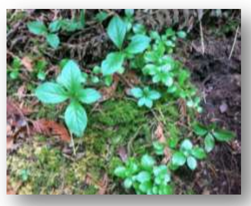
Twinflower and Western Star Flower growing in the bluff forest

Orange Honeysuckle Red Elderberry Salal Common Rush Slough Sedge Broadleaf Cattail Western Skunk Cabbage Bittersweet Nightshade Field Mint American Brooklime Aquatic Forget-Me-Not Seep Monkeyflower