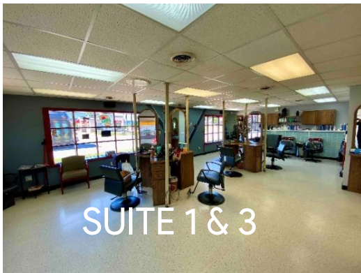
SUITE 1 & 3