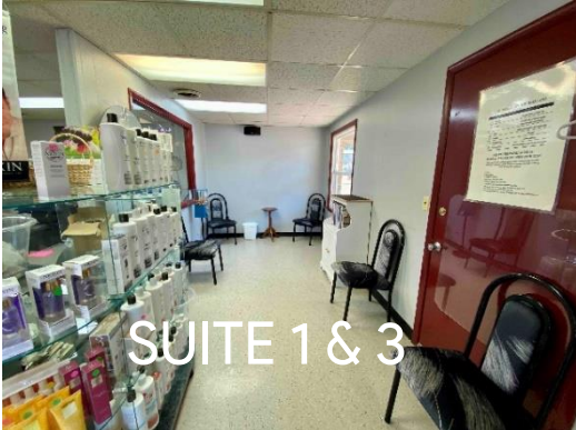
SUITE 1 & 3

COLDWELL BANKER COMMERCIAL DEVONSHIRE REALTY