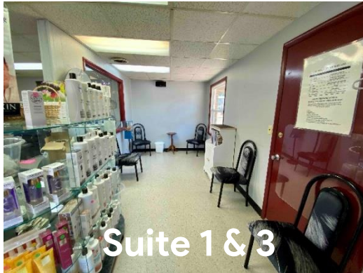
Suite 1 & 3