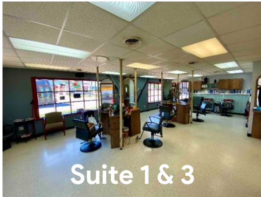
Suite 1 & 3