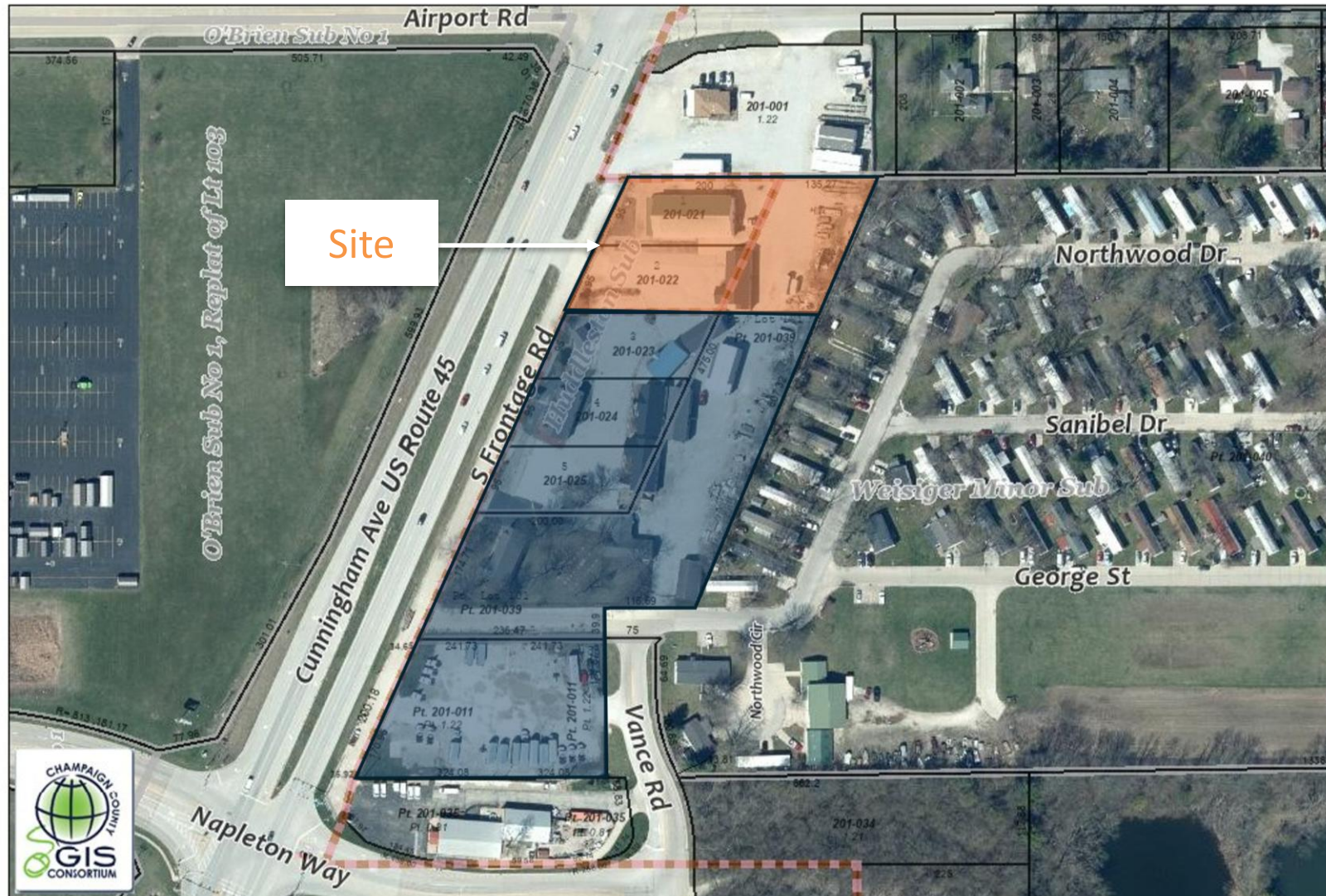
GIS Webmap Public Interface Champaign County, Illinois