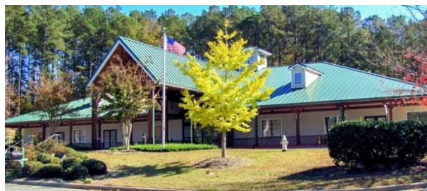
NORTH COBB SENIOR CENTER