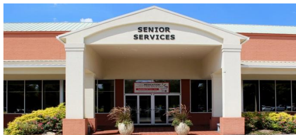
SENIOR WELLNESS CENTER

4915 Austell Powder Springs Rd – Austell, GA 30106