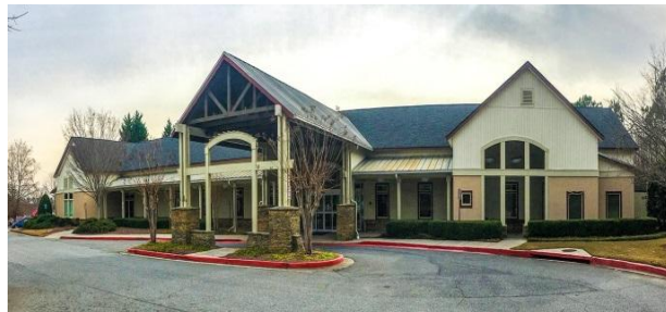
WEST COBB SENIOR CENTER