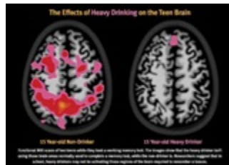
Figure. Functional M...

According to Squeglia, that type of drinking behavior isn't unusual for teenagers. "They tend to drink less frequently than adults, but when they do drink, they tend to drink in much larger quantities," she says.