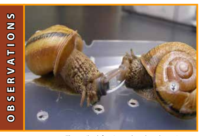
The snail at left points a sharp love dart at its mate.