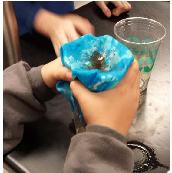
Dodgen MS 6th graders test a water filter they designed during the Filtration Station program