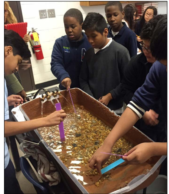
Campbell MS 6th graders measure stream width and depth

If you would like to schedule an outreach program from the Water Efficiency staff for your students, please email waterefficiency@cobbcounty.org or call 770.419.6374.