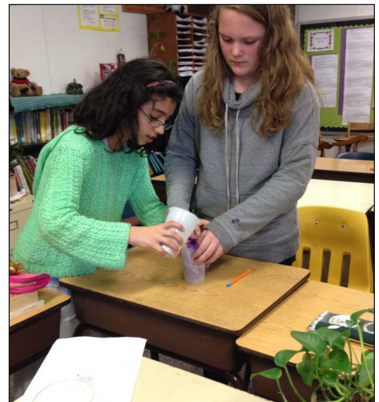
5th graders at Keheley ES build a water filter