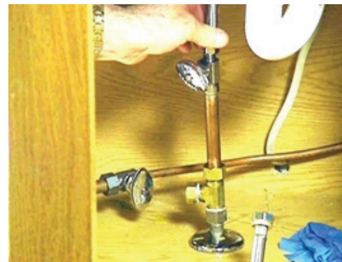
Under Sink Shutoff