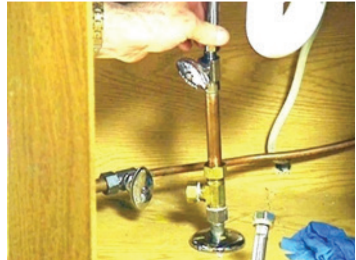
Under Sink Shutoff