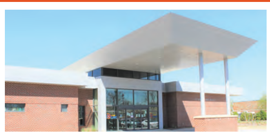
COBBLINC CUSTOMER SERVICE & PARATRANSIT CENTER 431 COMMERCE PARK DRIVE SE MARIETTA, GA 30060-2737

CobbLinc will complete the process and notify you of a decision. Once certified, you will need to make an appointment to attend orientation and obtain your Paratransit Photo ID/Breeze Card from the Paratransit Center.