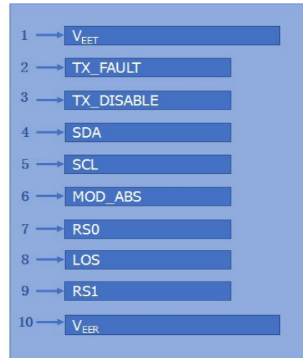
Bottom of Board