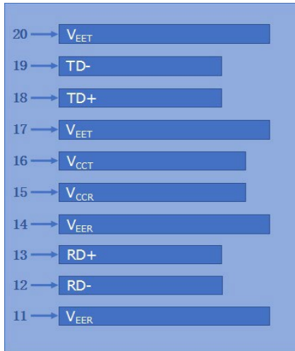
Top of Board