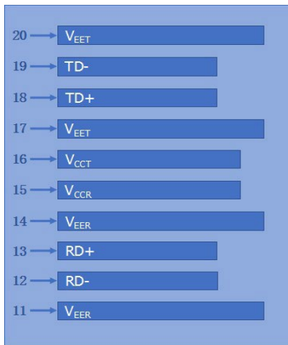
Top of Board