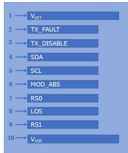
Bottom of Board