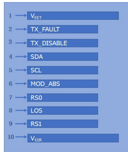
Bottom of Board