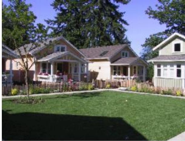
Figure 2. Cottage development examples. Note common open spaces and porches and semi-private open spaces oriented towards the commons.

F. Character. Cottages and accessory buildings within a particular cluster shall be designed within the same “family” of architectural styles. Example elements include: