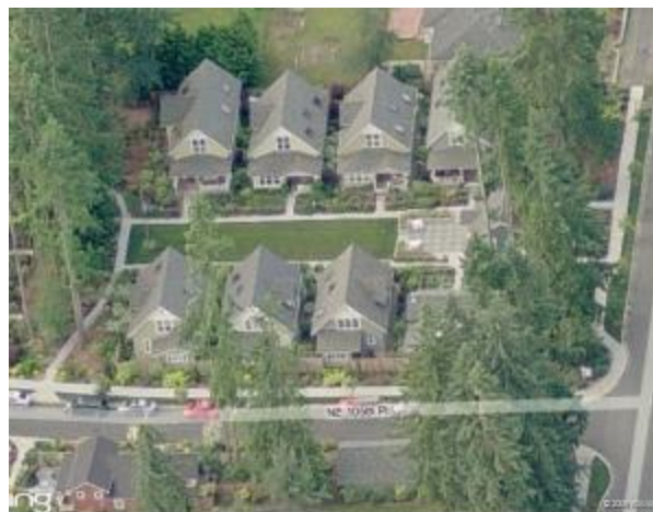
Figure 1. Cottage development examples.