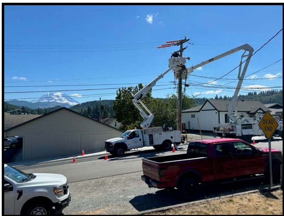
Below- Rainier 3 Phase Terminations