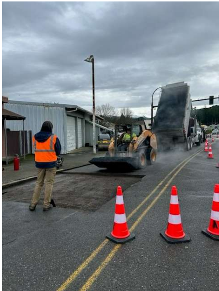
Water repair asphalt patch Center St E.