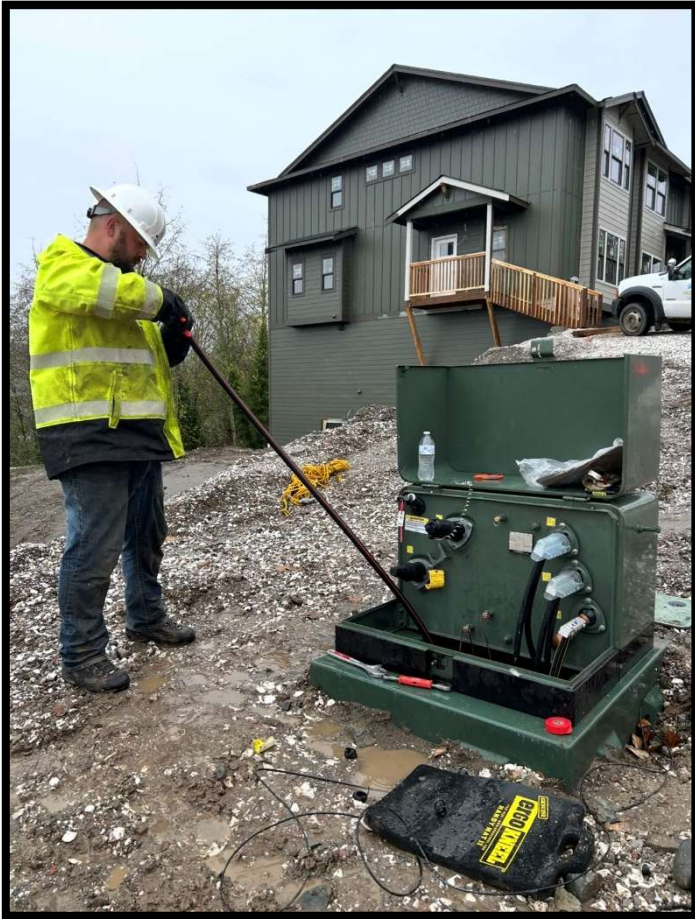
Apprentice Lineman terminating wire on Orchard Ave South