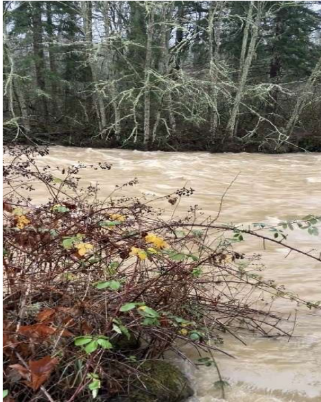
High Mashell River at Water Intake Structure during the rain event.