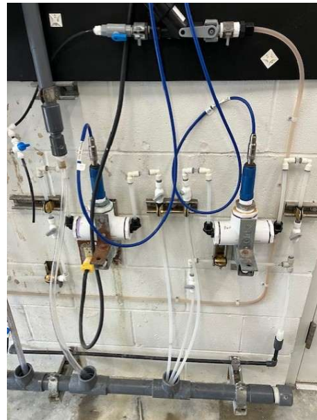
New sample tubing installed at the water treatment plant.