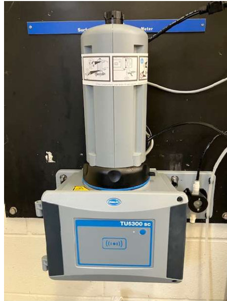
New surface water turbidity meter Installed at the water treatment plant