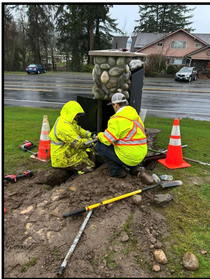
Nevitt Park Sign Install