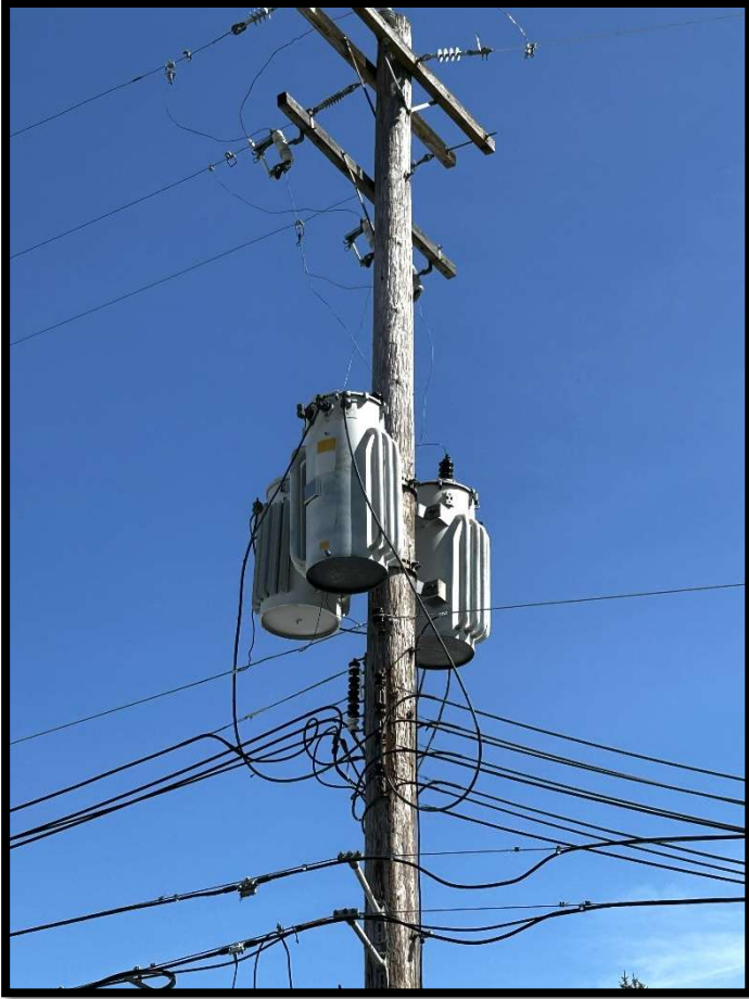
Plaza Market transformer bank shown with new secure connections