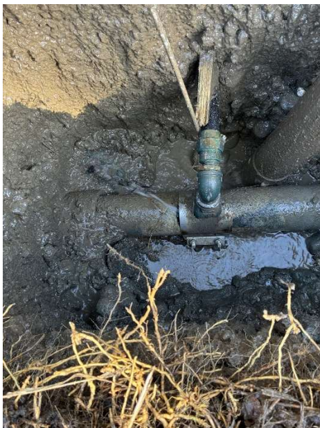
Water repair Eatonville Hwy W