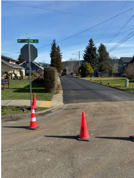
Paving Prospect St W