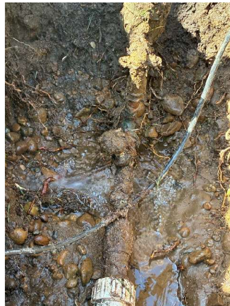
Water Repair Fir Ave N