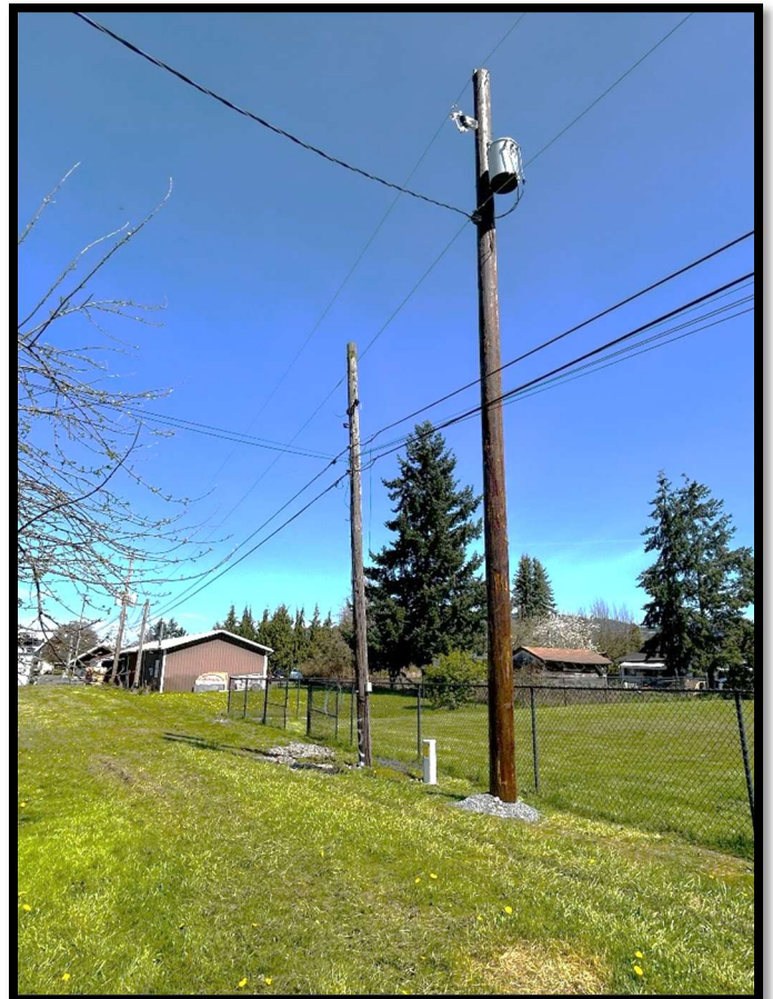
Tangent(inline) pole from rebuild south of Plaza Market. The primary conductor, transformer, and the pole was replaced at this site. Old pole to be removed after communication transfer.