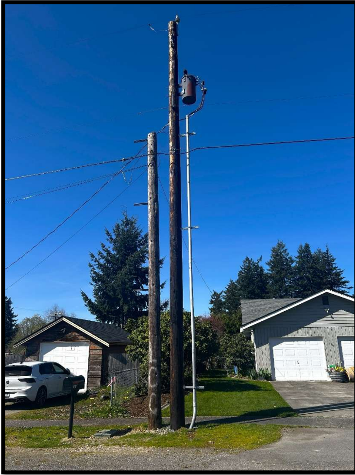
Carter & Penn- New pole(right) next to existing pole. Old pole will be removed when baby animals leave the nest.