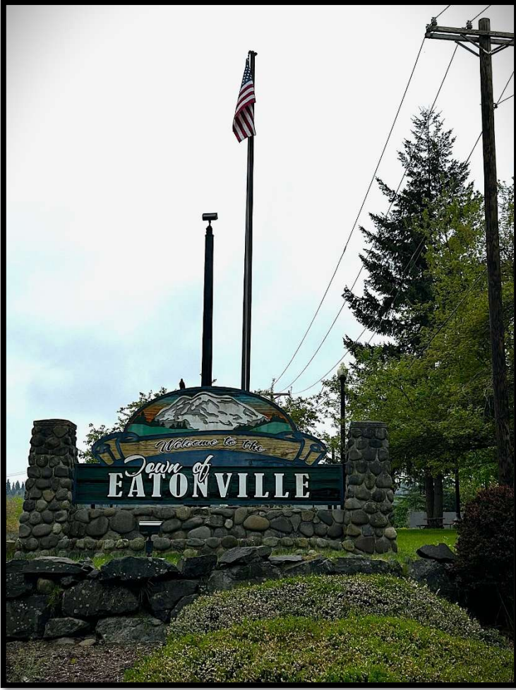
New Flag at Nevitt Park.