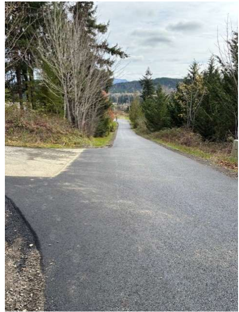
New Paving Prospect W