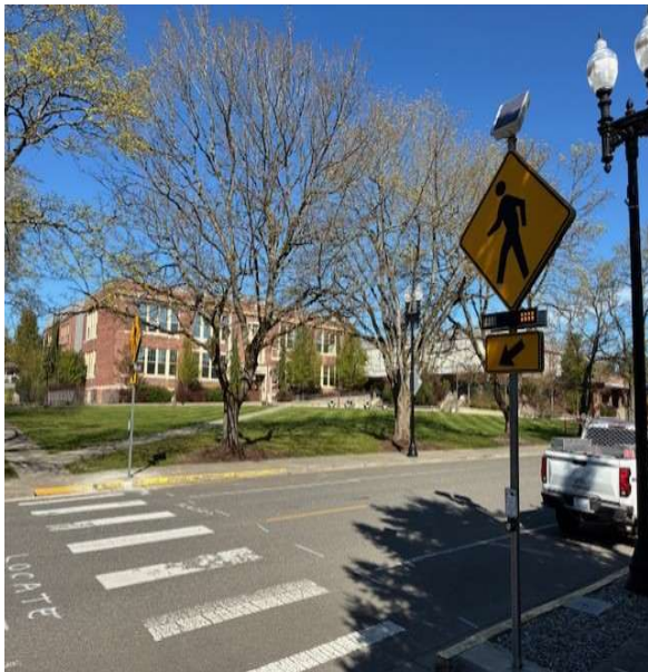
New Flashing Crosswalk Signs by High School