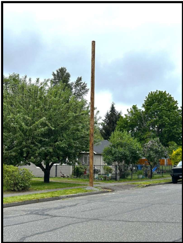
Eatonville Highway East Service Pole prepped for outage and secondary rework.

Eatonville Highway East service rework. The rework will remove the current wooden strike post and replace it with a code compliant strike knob.