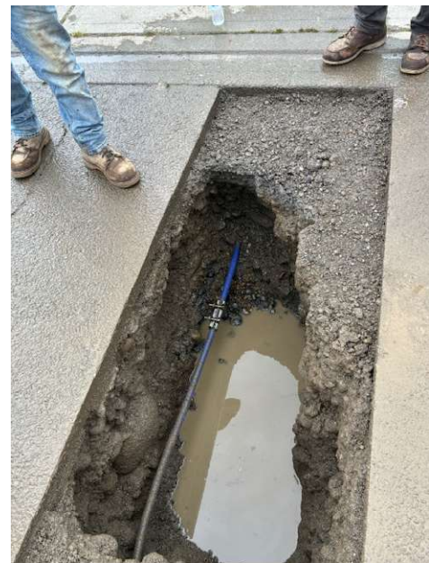
Water Repair Washington Ave S