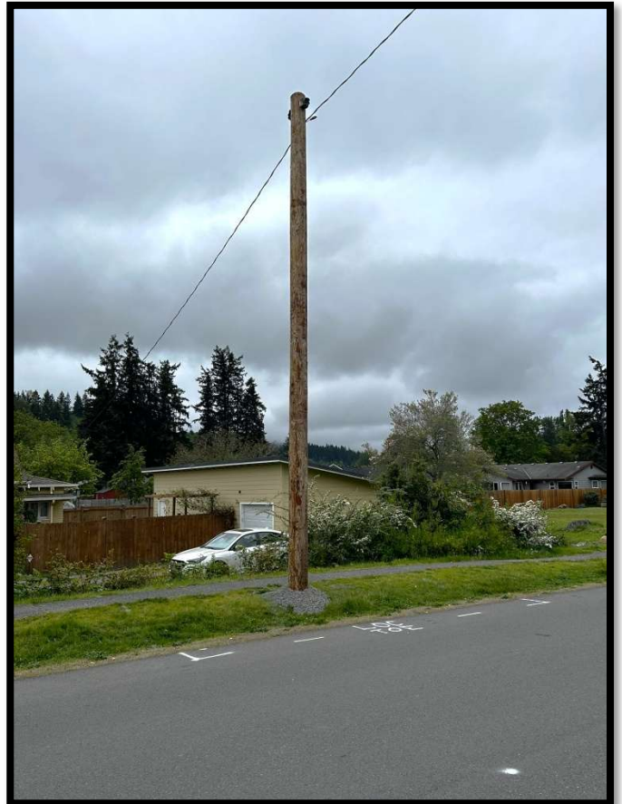
Carter & Penn- Service pole to raise secondary conductors.