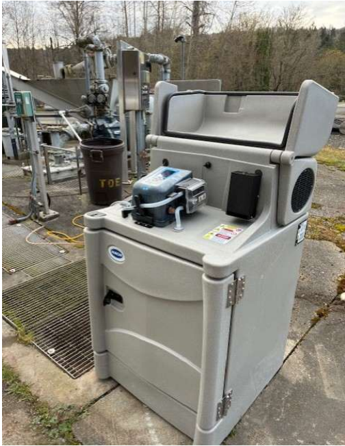
New Composite Sampler Wastewater Plant