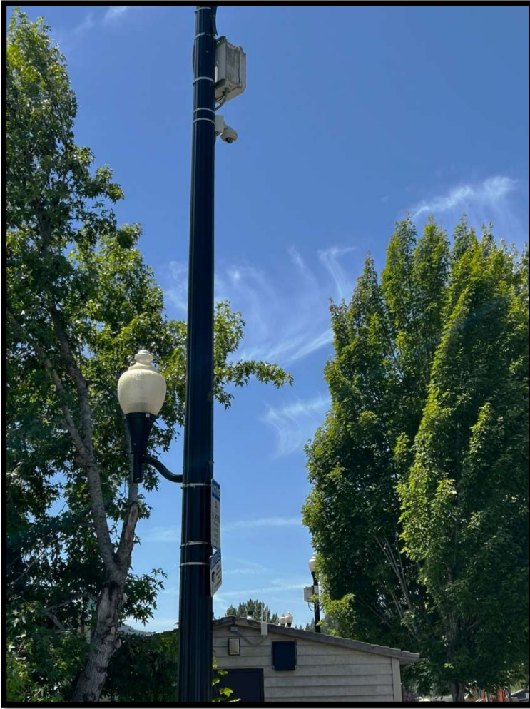
Mill Pond Park- Large tree branch was removed allowing the equipment shown on building to communicate with camera shown on pole