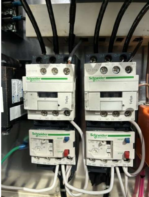
New contactors Riverside sewer lift Station.