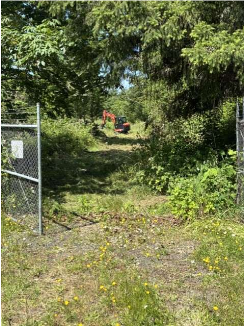
Brush Mowing behind the Water Treatment Plant to rebuild road and waste piping