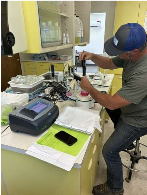
Wastewater lab PE testing