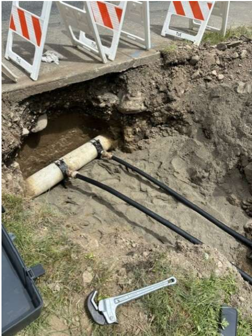
New water services installed on Lynch