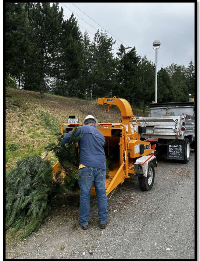
Center Street tree trimming near closed bridge, Bottom Left- Before, Bottom Right- After