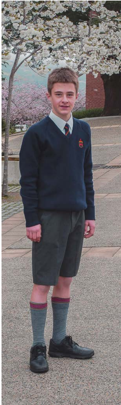
Junior Uniform - formal