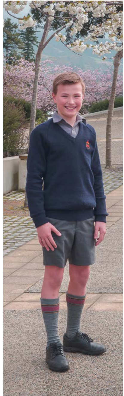
Junior Uniform - informal