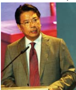
Peter Favila, Secretary, Department of Trade and Industry, the Philippines

Welcoming delegates, Peter Favila, Secretary, Department of Trade and Industry, the Philippines, said the Conference