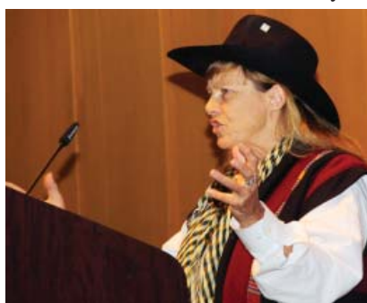
Hunter Lovins, Founder, Natural Capitalism, stressed that nuclear is not a good alternative to fossil fuels

Hunter Lovins, Founder, Natural Capitalism, emphasized that the world’s economy exists to serve the needs of society rather than society existing to serve the interests of business. She provided numerous examples of how companies and agencies around the world are using “bio-mimicry” and closing the loop on resource flows to reduce resource consumption while simultaneously enhancing profitability.