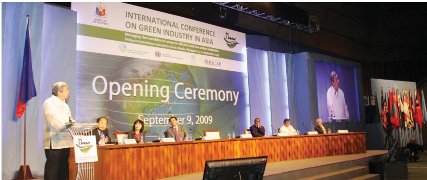
Jose Atienza, Secretary, Department of Environment and Natural Resources, delivered his keynote address, and stressed that the global financial and climate change crises while both independent problems, cannot be solved with separate solutions