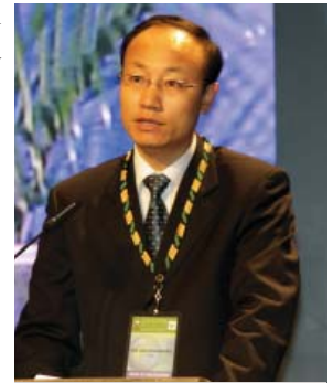
Gao Donsheng (China)

the emergence of the global financial crisis. He highlighted the launch of a national solar energy programme, called for greening urbanization, stressed the need for pragmatic and realistic approaches for combating climate change, and underlined the importance of green industry in these efforts. Indonesia said the largest users of energy within its industrial sector were the cement, iron and steel, and paper industries. He noted the country's national targets to reduce overall carbon emissions, and highlighted effective coordination across ministries. The Maldives said the government aimed to increase foreign investment, particularly in the renewable energy and environmental tourism sectors, as well as building capacity to manage foreign investments. He noted that although the Maldives' contribution to climate change was negligible, it aimed to be part of the solution and was committed to achieving carbon neutrality within 10 years.