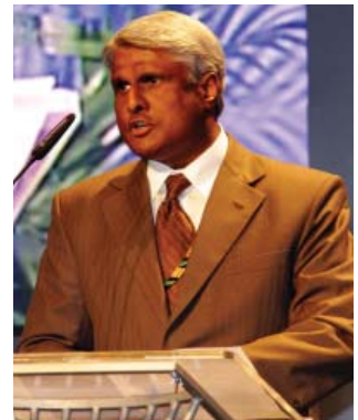
Mohamed Rasheed (Maldives)

the emergence of the global financial crisis. He highlighted the launch of a national solar energy programme, called for greening urbanization, stressed the need for pragmatic and realistic approaches for combating climate change, and underlined the importance of green industry in these efforts. Indonesia said the largest users of energy within its industrial sector were the cement, iron and steel, and paper industries. He noted the country's national targets to reduce overall carbon emissions, and highlighted effective coordination across ministries. The Maldives said the government aimed to increase foreign investment, particularly in the renewable energy and environmental tourism sectors, as well as building capacity to manage foreign investments. He noted that although the Maldives' contribution to climate change was negligible, it aimed to be part of the solution and was committed to achieving carbon neutrality within 10 years.