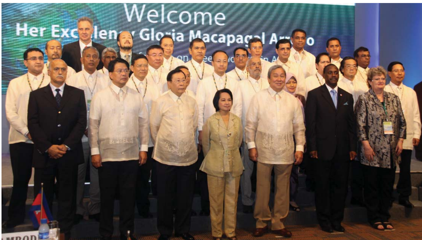
Delegates from the High-Level plenary with H.E. President Gloria Macapagal-Arroyo