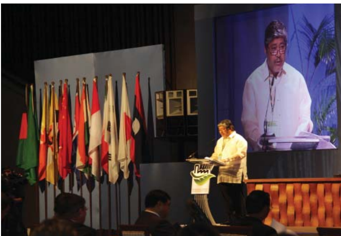
Enrique Manalo, the Philippines

The Republic of Korea noted that the promotion of green growth in the country would improve energy security, and said the government has established a national green growth strategy to encourage the conservation of energy and the expansion of new and renewable energy technologies. He said that the global financial crisis was a "wake-up call" and that business as usual was no longer possible. Sri Lanka noted that the government has prioritized establishing "truly" sustainable development paths, and ensuring the integration of environment and social concerns into economic development paths. He highlighted that Sri Lanka has introduced policies for greening industry, and that a number of institutions have been established to improve resource efficiency. Vietnam said ESCAP's green industry initiative provides a pragmatic new approach to industrial development based on the efficient use of natural resources. He stressed the imperative for countries to modify current consumption and production patterns with the aim of improving resource efficiency and minimizing environmental impacts. He further stressed the importance of the UNIDO Green Industries Initiative to guide and create opportunities for environmentally-friendly services and products, particularly for small to medium sized enterprises (SMEs).