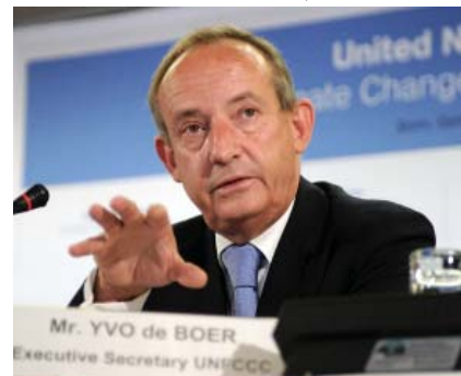
UNFCCC Executive Secretary Yvo de Boer discusses the status of negotiations and expected outcomes of the Bonn climate change talks

sidary Body for Implementation (SBI) is considering, amongst other items, the modalities for the review of the Kyoto Protocol's Adaptation Fund in Cancún, Mexico, at the end of the year ( http://www.iisd.ca/climate/sb32/ ).