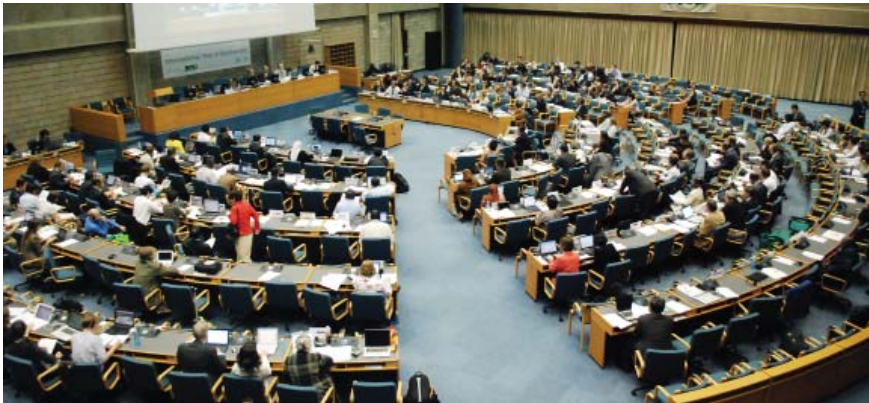
A bird's eye view of one the WGRI 3 plenary sessions