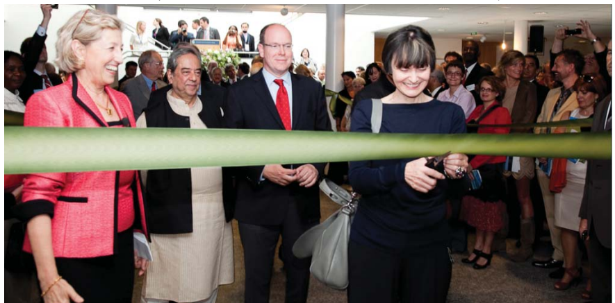
IUCN's new Conservation Centre inauguration. L-R: Julia Marton-Lefèvre, Director General, IUCN; Ashok Khosla, President of IUCN; H.S.H. Prince Albert II of Monaco; and Micheline Calmy-Rey, Swiss Foreign Minister.

The Ramsar Secretariat has also informed that its headquarters have moved to a new IUCN sustainable office building – IUCN's new Conservation Centre, which was inaugurated on 4 June 2010. The Centre's innovative features include: use of rainwater for toilets and irrigation; heat recuperation from refrigerators to produce hot water; a CHF one million solar parc from Romande Energie Renouvelable that also provides energy back to the Swiss electricity grid; energy efficient lighting; local and recycled building materials; geothermal heating; and a decentralized carbon dioxide controlled air supply system ( http://www.iucn.org/about/union/secretariat/centre/ ).