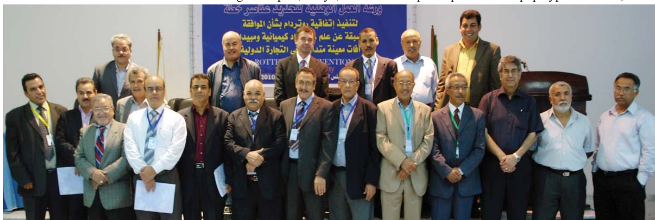
Participants of the national planning meeting on the implementation of the Rotterdam Convention

2010. The meeting brought together major stakeholders involved in chemicals management to review the status and identify elements of a national plan to implement the Rotterdam Convention. Recommendations from the meeting included to: establish a National Unit on implementation of the Rotterdam Convention; activate a poison control centre; and organize an awareness campaign on the hazards of chemicals ( http://www.pic.int/home.php?type=s&id=77 ).