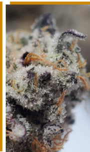
Izzy Haze 25.27% THC