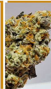
Oreo Mint Kush 23.26% THC