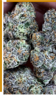
Ice Cream Cake 18.29% THC