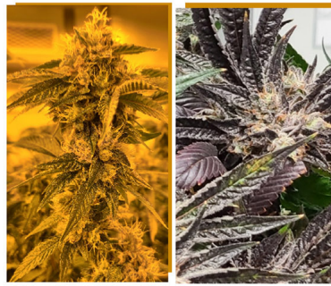
Tom Ford Island Pink 21-26% THC

*This strain has been tested. Certificate of analysis available upon request.