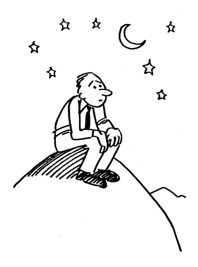
Have we found the meaning of life?