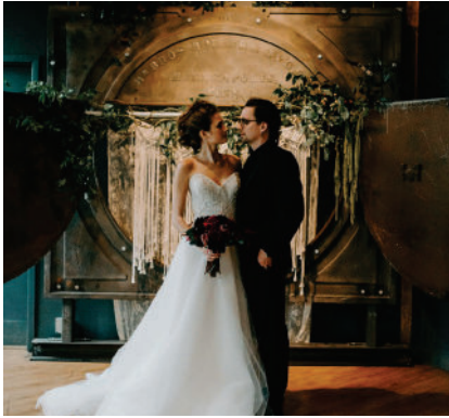
Historic Boilerplate Door

Our historic and one-of-a-kind venue offers the perfect blend of character, charm, and elegance—making it the ideal backdrop for a wedding day you'll never forget.