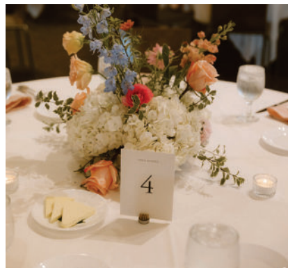
Votive Candles & Table Numbers

Crafted from reclaimed wood from the Harley Davidson plant