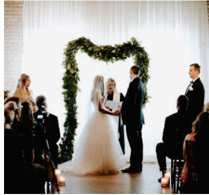
Abundant Natural Light