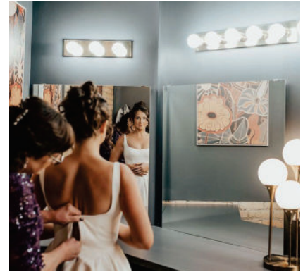
Private Bridal Suites