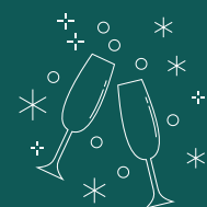
Table linens & choice of napkin color, serveware, glassware & silverware

Variety of table options (bistro, accent, service) & indoor reception chairs