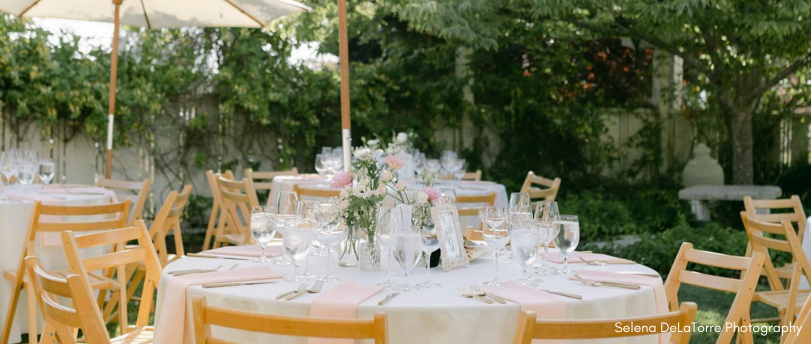
Selena DeLaTorre Photography