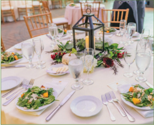
Yours Truly Media