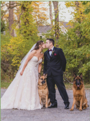
Yours Truly Media