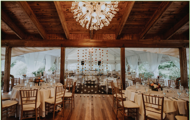
Cory Lynn Tucker Photography