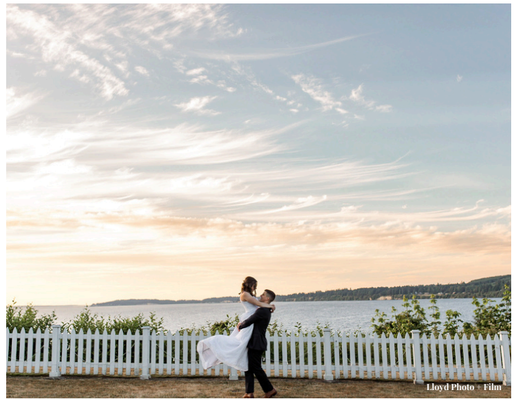
Lloyd Photo + Film