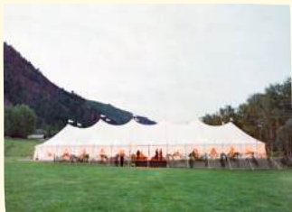
THE MAIN MEADOW

The T-Lazy-7 Event Lodge is a stunning reception venue with a private patio surrounded by beautiful gardens and manicured lawns, creating a magical backdrop for cocktail hours, lawn games, and cozy s'mores around the bonfire. Adjacent to a stunning bar area, our dining room features a spacious dance floor and elevated entertainment stage, ensuring an unforgettable experience for every guest. Vaulted ceilings, a wrap-around balcony, and two stone fireplaces create a warm inviting atmosphere for your perfect Colorado getaway.