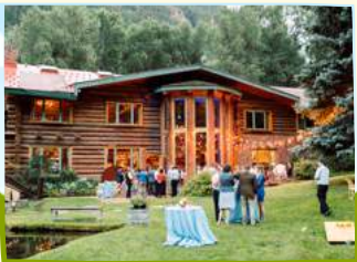
THE EVENT LODGE

The T-Lazy-7 Event Lodge is a stunning reception venue with a private patio surrounded by beautiful gardens and manicured lawns, creating a magical backdrop for cocktail hours, lawn games, and cozy s'mores around the bonfire. Adjacent to a stunning bar area, our dining room features a spacious dance floor and elevated entertainment stage, ensuring an unforgettable experience for every guest. Vaulted ceilings, a wrap-around balcony, and two stone fireplaces create a warm inviting atmosphere for your perfect Colorado getaway.