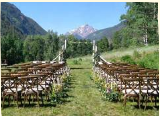
THE MOUNTAIN MEADOW

The Main Meadow is the ideal location for a picturesque ceremony and twinkle-lit tented reception under the stars. Horses and grazing cattle often appear in the backdrop of this rolling mountain meadow, with the steady Pyramid Peak standing snow-capped at the end of the valley. Located just 12 minutes from downtown Aspen, it's surrounded by beautiful National Forest and wilderness, creating the perfect atmosphere for an unforgettable celebration.