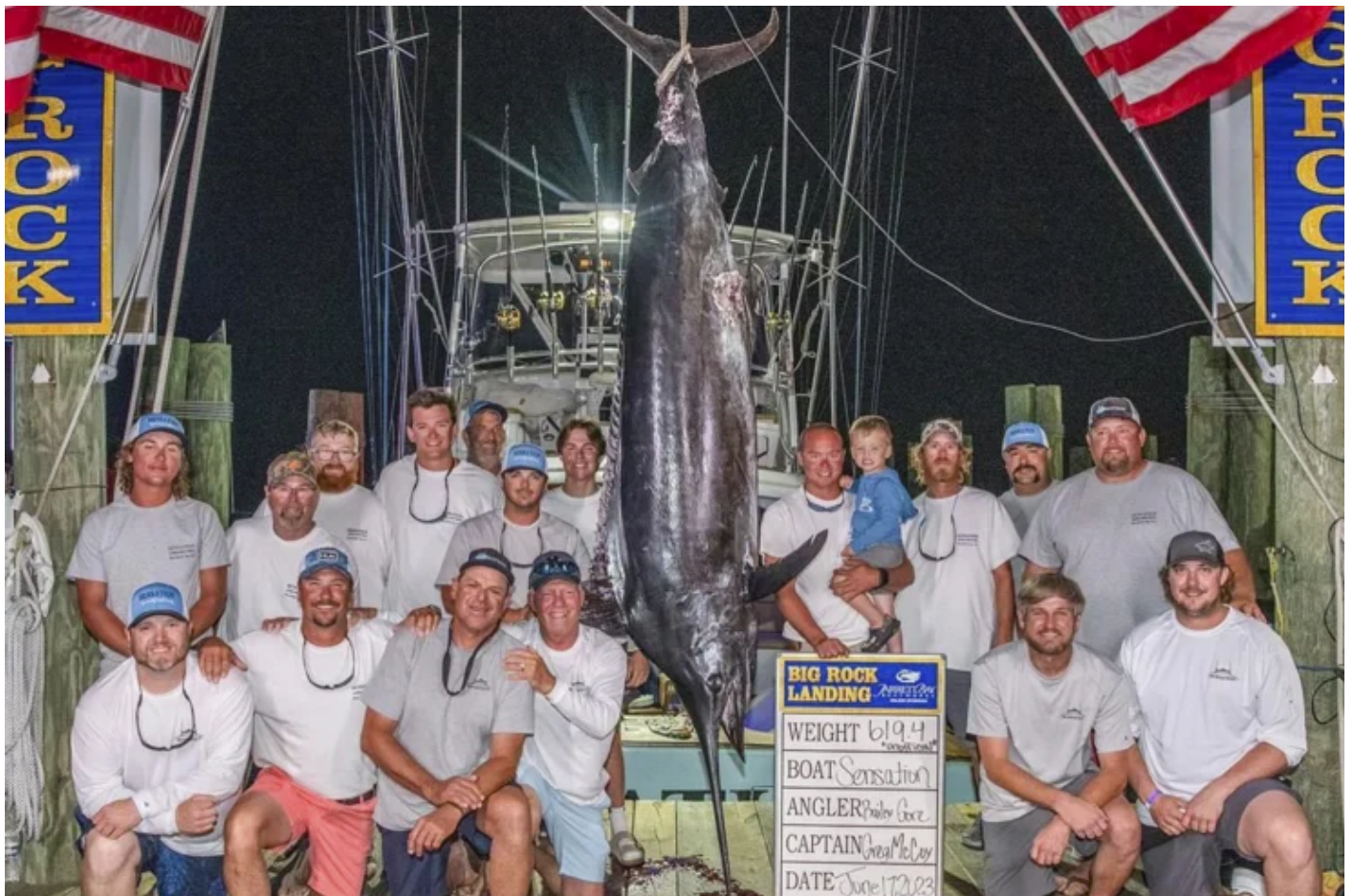
The Sensation crew with their 600-plus-pound marlin and their dreams still intact.