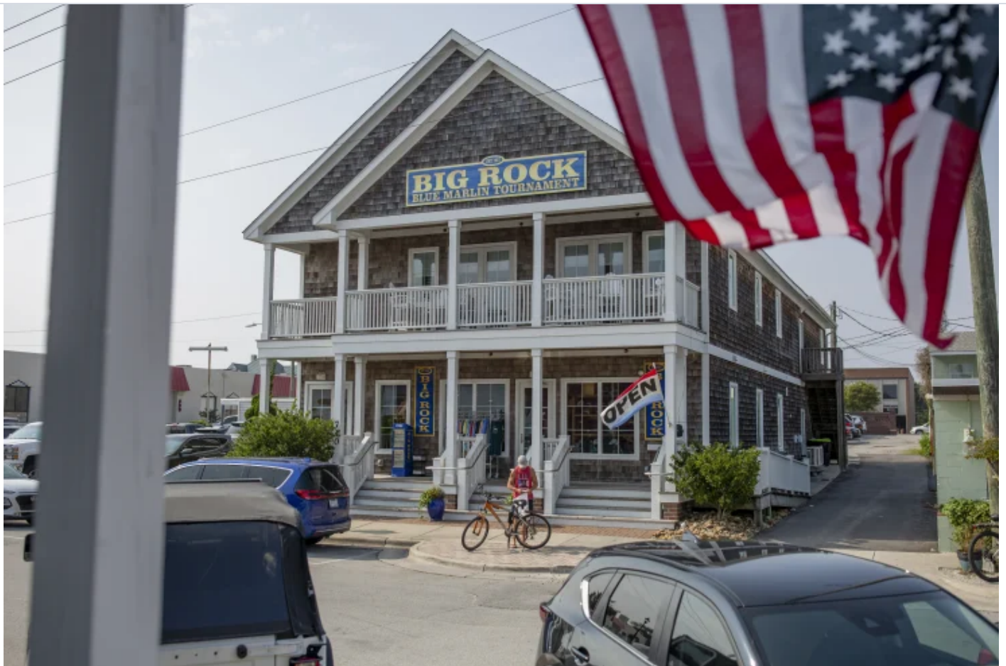
The Big Rock Blue Marlin Tournament store in Morehead City, North Carolina, on June 30, 2023. The tournament is a major civic event in Morehead City.