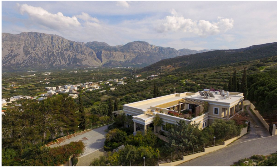
Mylona works out of the Institute for Aegean Prehistory Study Center for East Crete.

“In order to know what you are looking at, you need first to establish a reference collection,” she says as she pulls out box after box of bones lining her office shelves. A reference collection is a kind of archive of skeletons that allows zooarchaeologists to compare excavated remains with the bones of present-day creatures. “In Greece in 1993, there was not a single reference collection for fish bones—none whatsoever,” Mylona says. “Zooarchaeology is not taught in Greek universities, so there are no university collections of fish skeletons.”