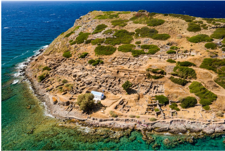
For decades, despite the presence of so many settlements along coastlines, archaeologists did not believe the Mediterranean Sea was rich enough to sustain populations.

“Fish are different,” she says. “Cattle, sheep, goats—these were all animals used for sacrifice in religious rituals. There was a methodology in how you approached their slaughter and treatment. In classical Greece of the fourth and fifth centuries BCE, and probably also earlier, they were ceremonially slaughtered and eaten. You find their remains on altars, on places of sacrifice, and everywhere within settlements.” But fish, she says, occupied a place in society more closely linked to the day-to-day, something that is only realized when archaeological evidence is put in context of “softer” remains like ancient literature.