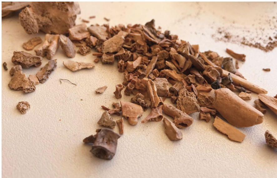
Mylona created a reference collection, a kind of archive of skeletons, that allows zooarchaeologists to compare excavated remains with the bones of present-day creatures.

“The thing is that most fish bones are small, especially in this part of the world. Small fish predominate,” she says. But even the larger fish, a grouper of seven kilograms, for instance, leave bones that may be no larger than two centimeters. “You can’t easily see them in the course of an excavation. If you do it out in the open, if the light is not right, and if you are really hot and tired, you may not see it.”