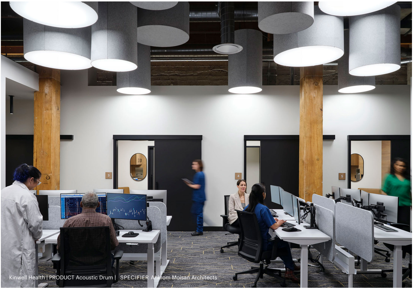
Kinwell Health | PRODUCT Acoustic Drum | SPECIFIER Ankrom Moisan Architects