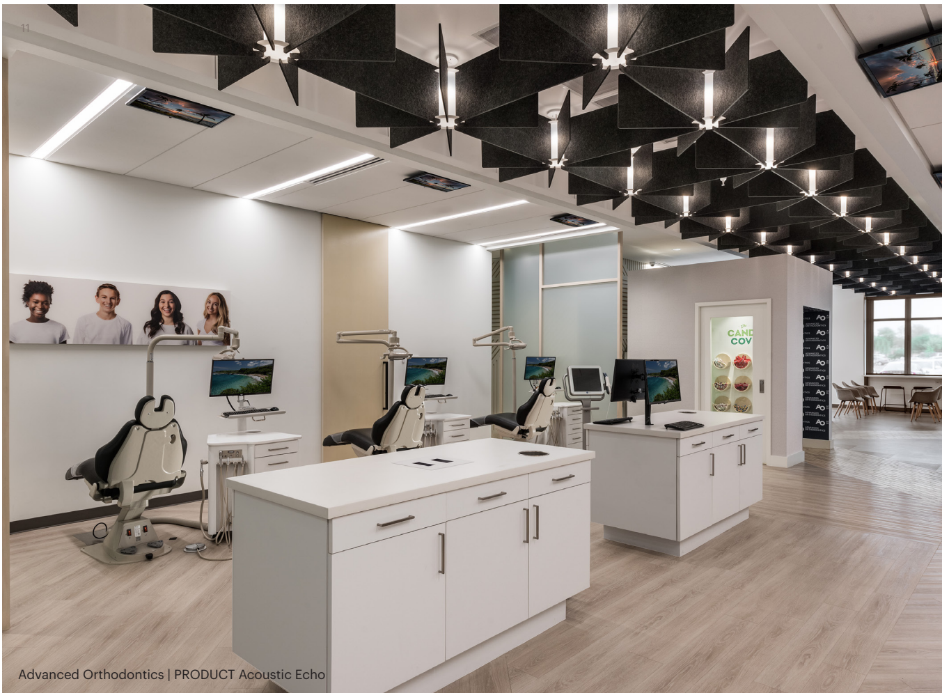
Advanced Orthodontics | PRODUCT Acoustic Echo