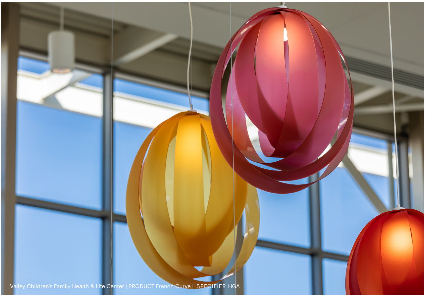
Valley Children's Family Health & Life Center | PRODUCT French Curve | SPECIFIER HGA