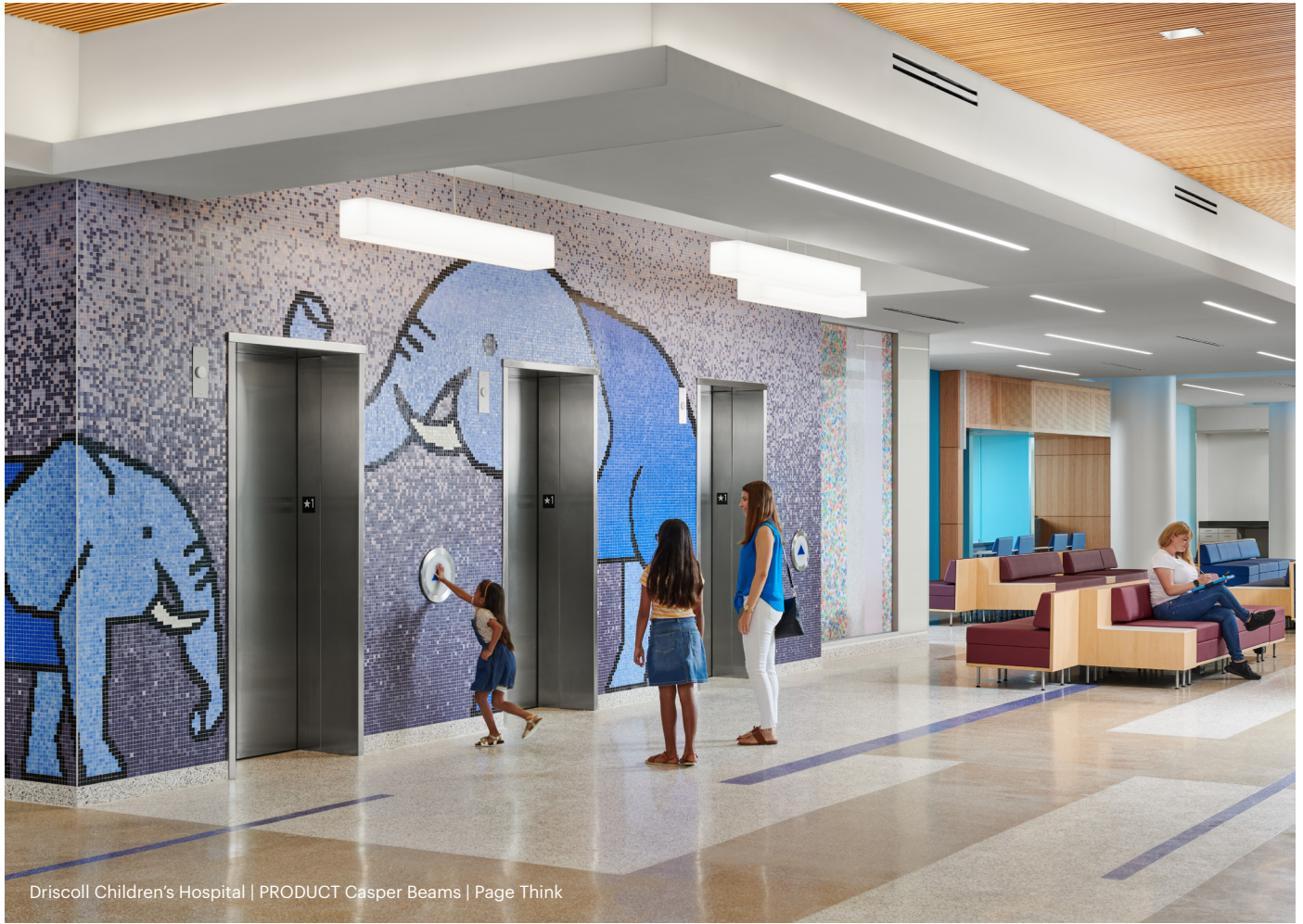
Driscoll Children's Hospital | PRODUCT Casper Beams | Page Think