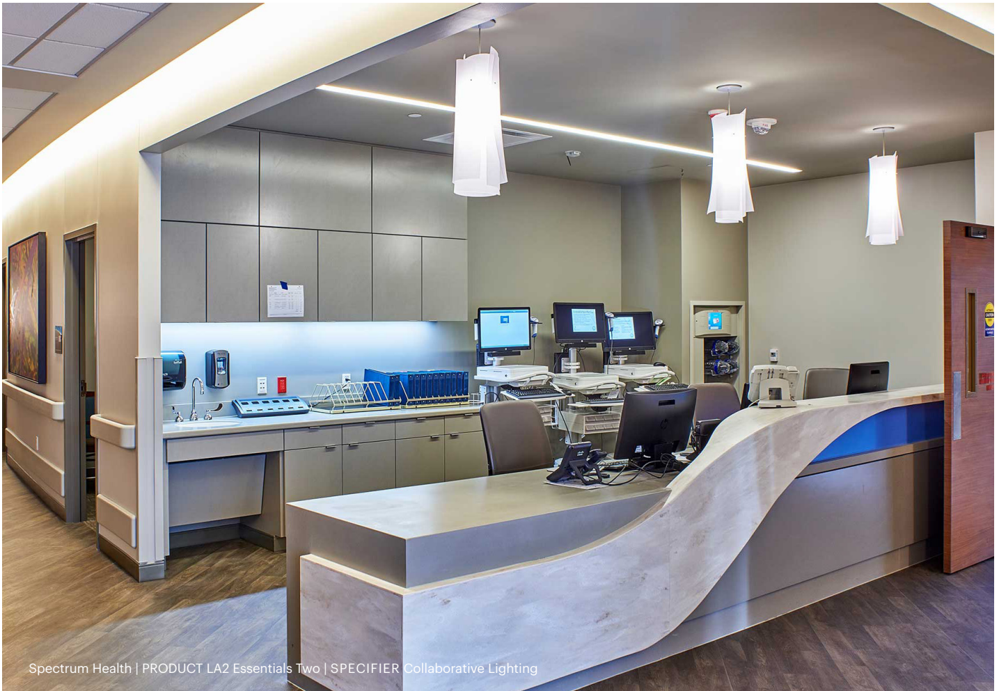
Spectrum Health | PRODUCT LA2 Essentials Two | SPECIFIER Collaborative Lighting