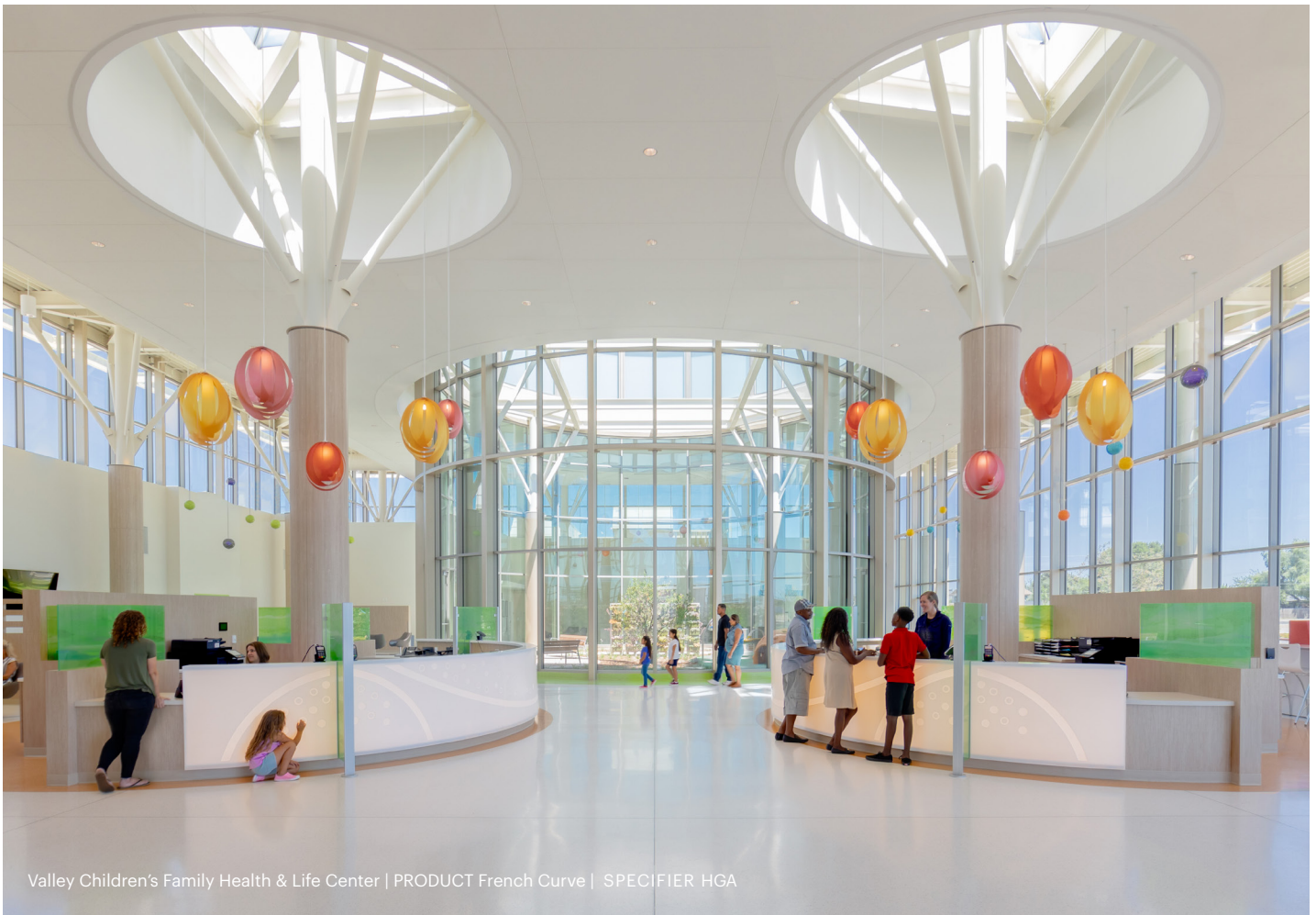
Valley Children's Family Health & Life Center | PRODUCT French Curve | SPECIFIER HGA