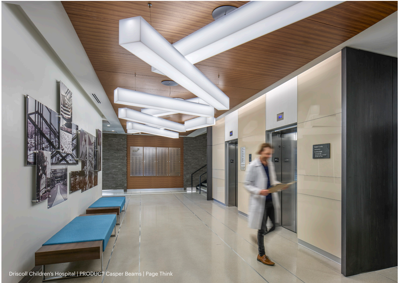
Driscoll Children's Hospital | PRODUCT Casper Beams | Page Think