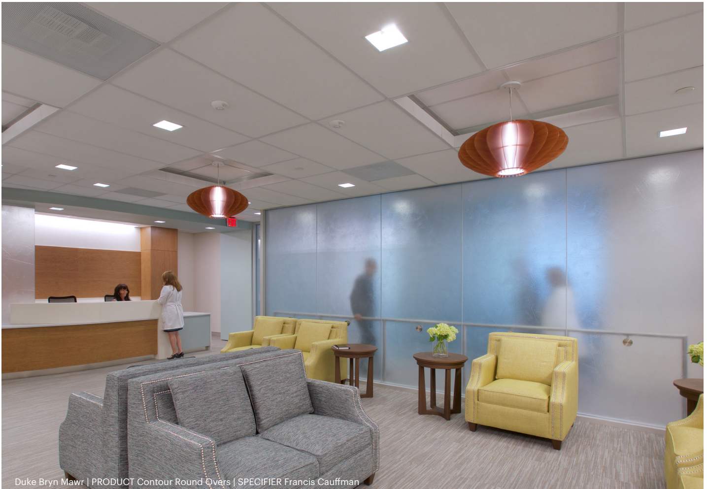
Duke Bryn Mawr | PRODUCT Contour Round Overs | SPECIFIER Francis Cauffman