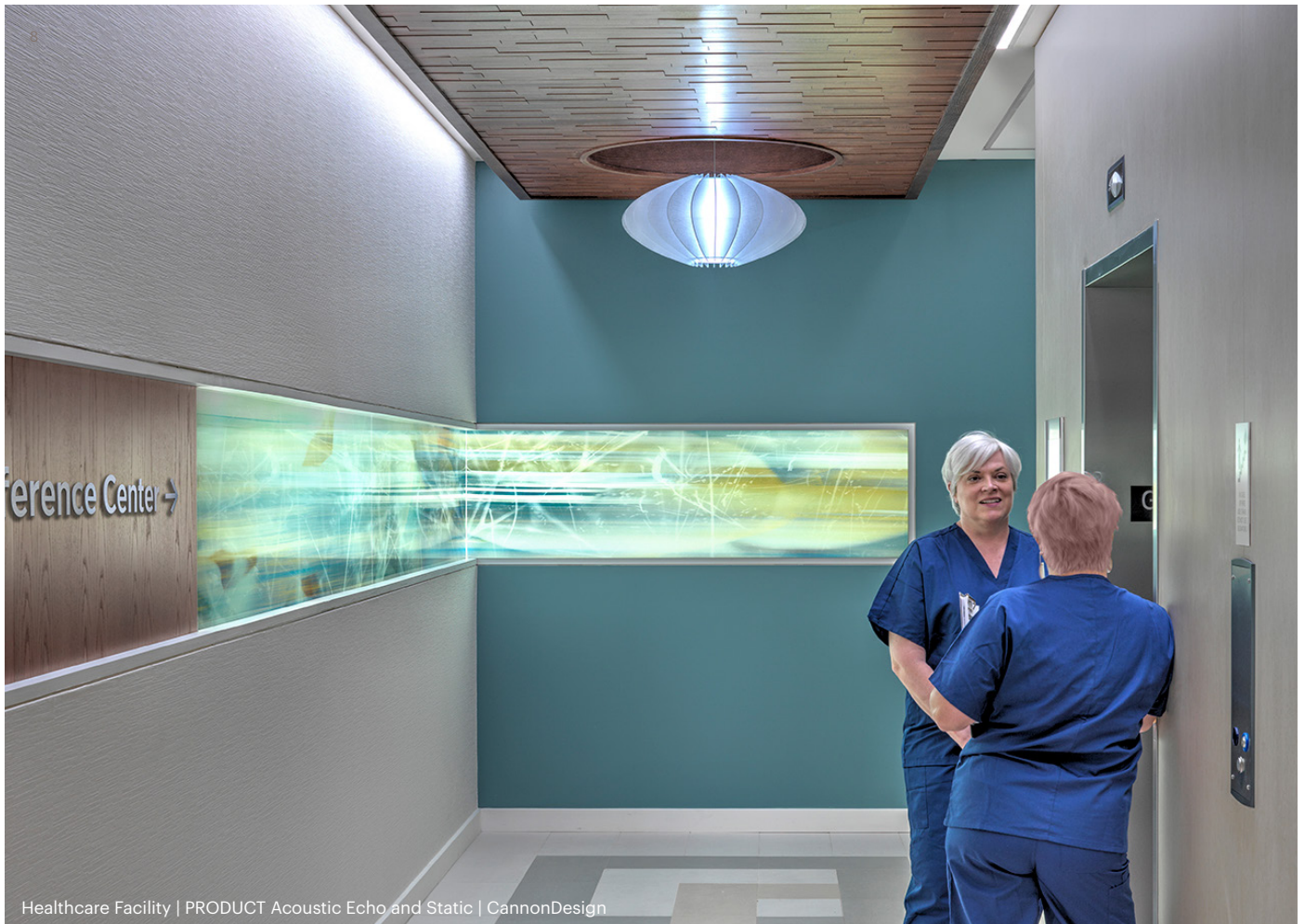
Healthcare Facility | PRODUCT Acoustic Echo and Static | CannonDesign