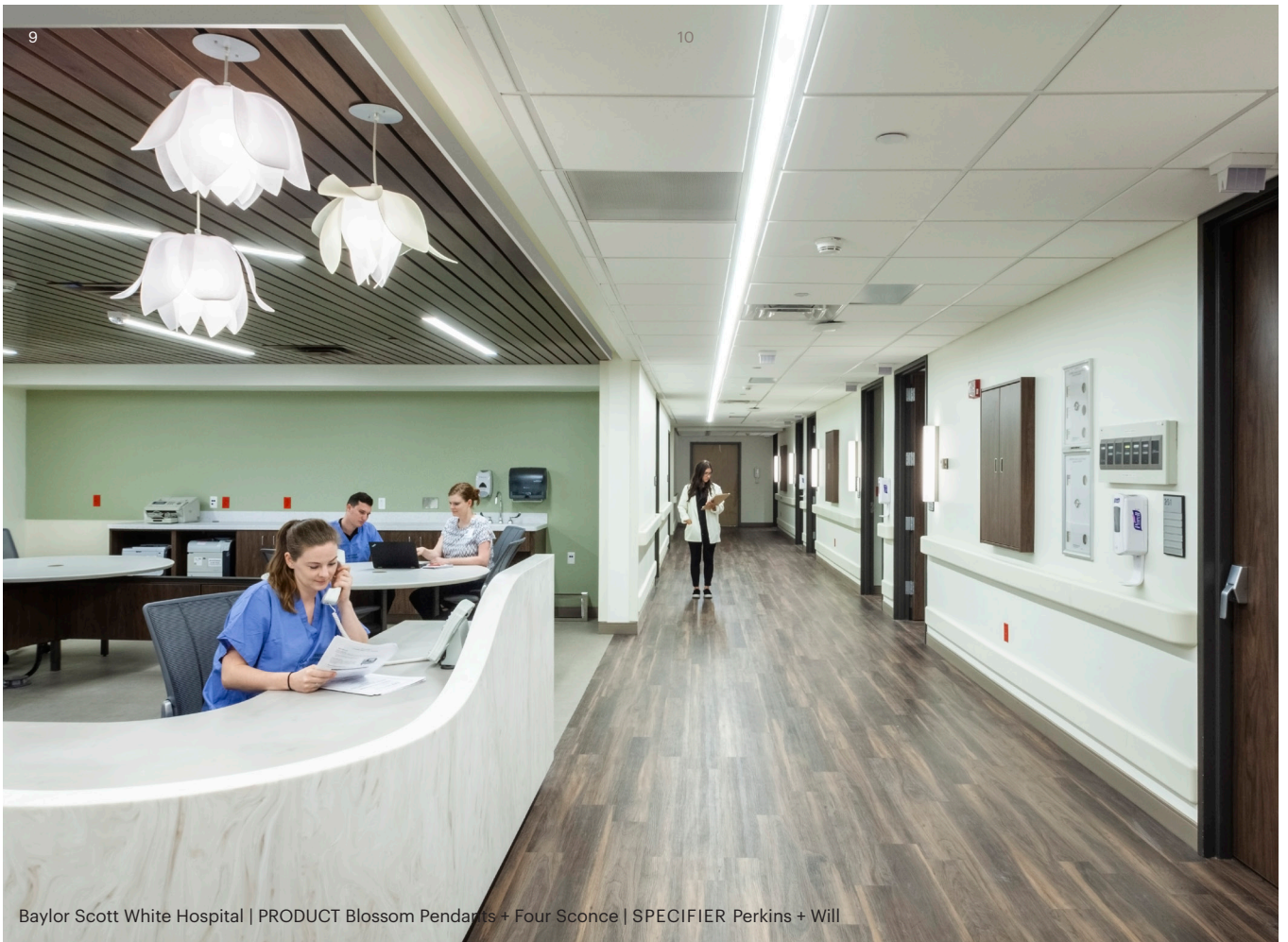
Baylor Scott White Hospital | PRODUCT Blossom Pendants + Four Sconce | SPECIFIER Perkins + Will