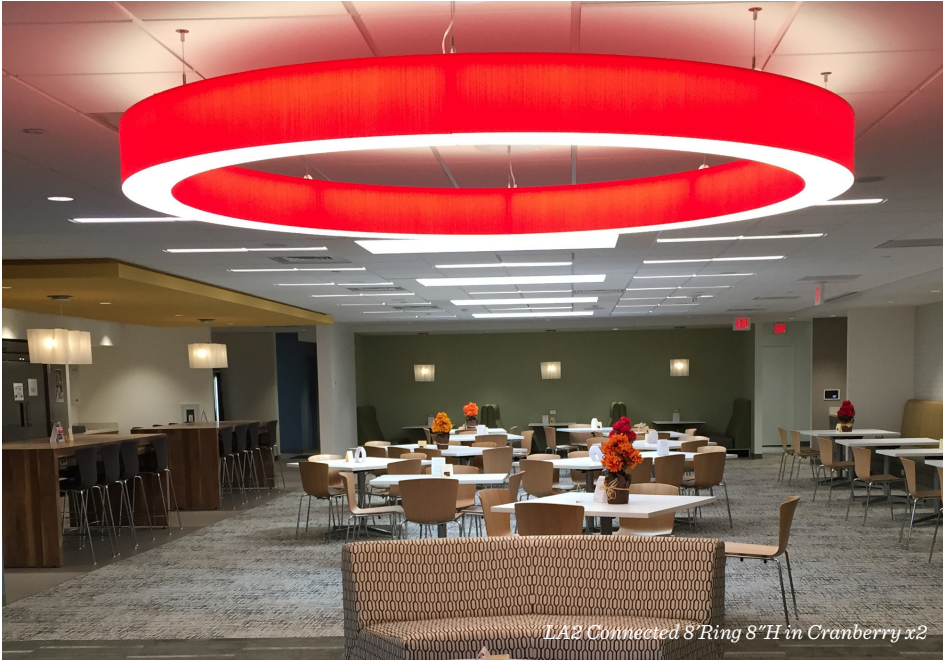
LA2 Connected 8' Ring 8"H in Cranberry x2