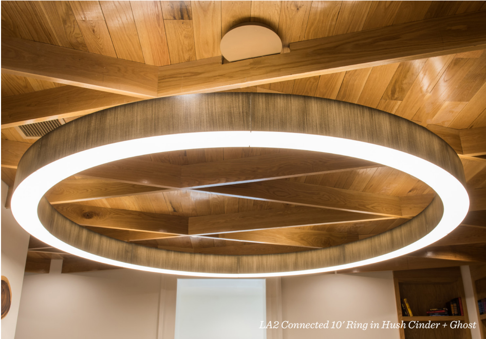
LA2 Connected 10' Ring in Hush Cinder + Ghost