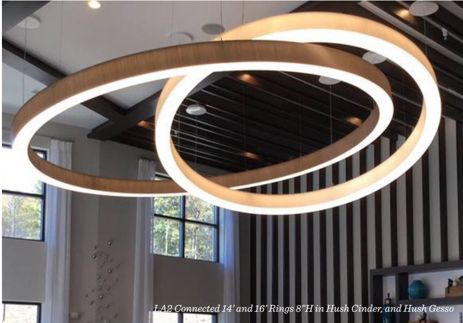
LA2 Connected 14' and 16' Rings 8"H in Hush Cinder, and Hush Gesso