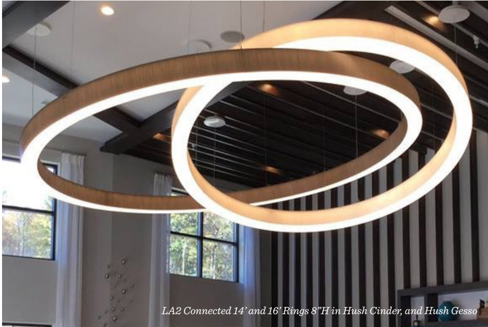
LA2 Connected 14' and 16' Rings 8"H in Hush Cinder, and Hush Gesso