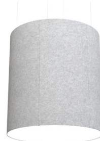
44"Dia x 48"H