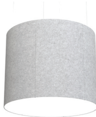
44"Dia x 36"H