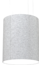
30"Dia x 48"H