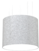
30"Dia x 48"H