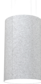
30"Dia x 48"H