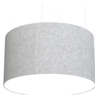
44"Dia x 24"H