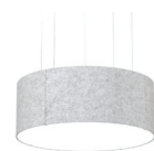
30"Dia x 48"H