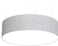
44"Dia x 12"H