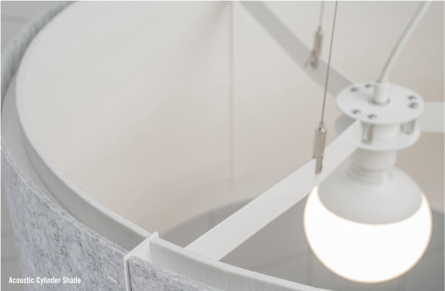
Acoustic Cylinder Shade