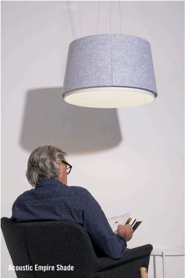
Acoustic Empire Shade