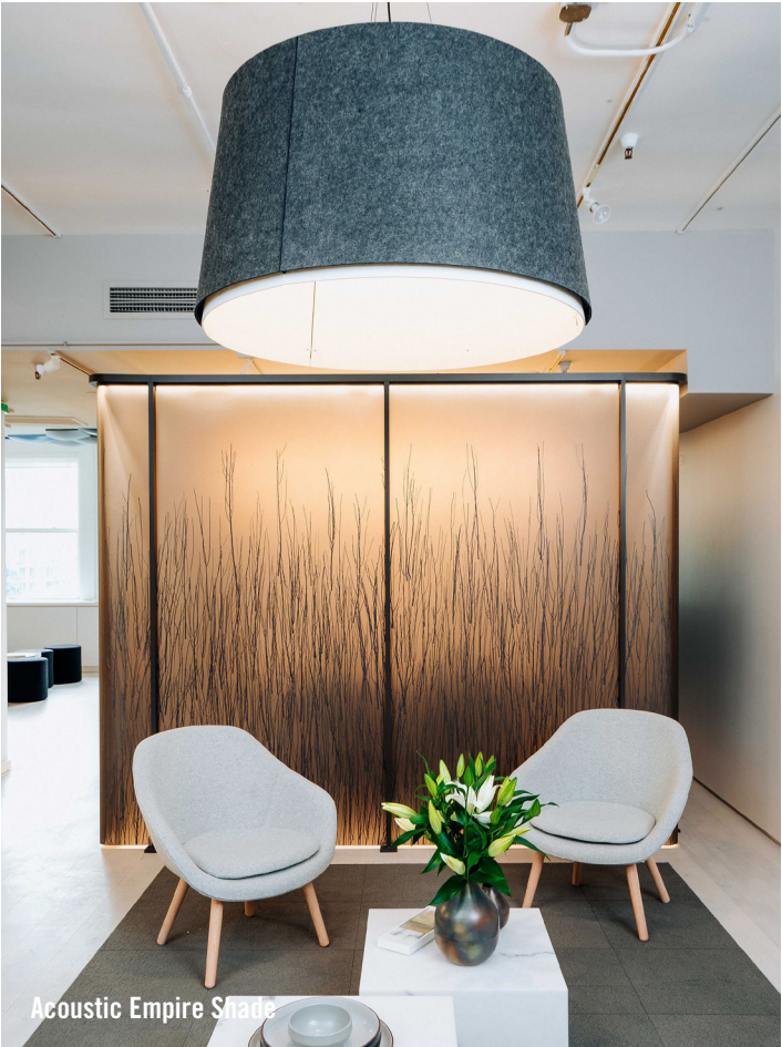
Acoustic Empire Shade