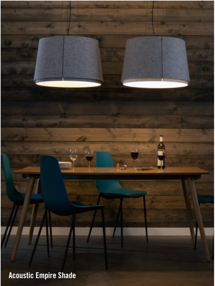
Acoustic Empire Shade