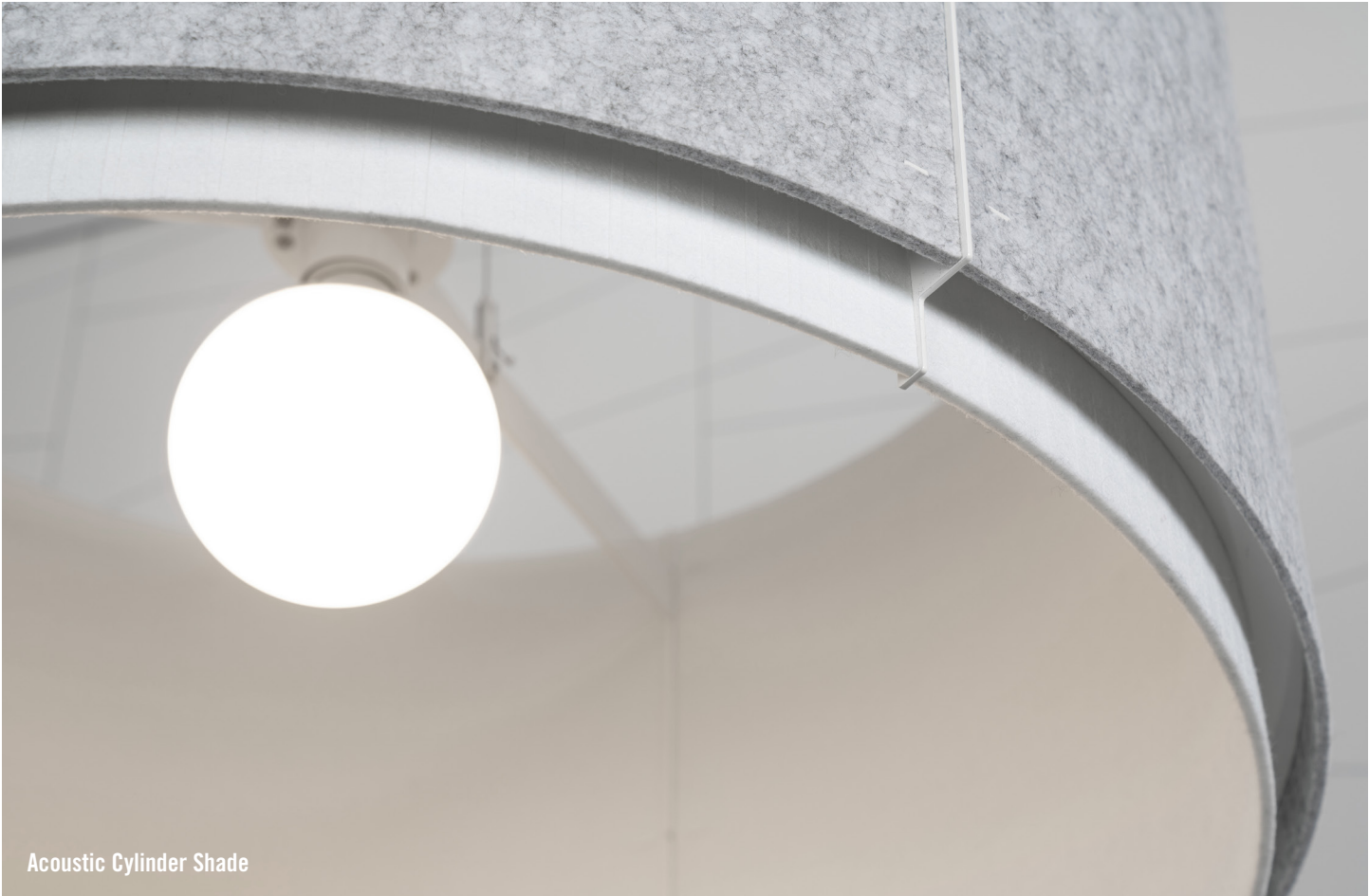
Acoustic Cylinder Shade