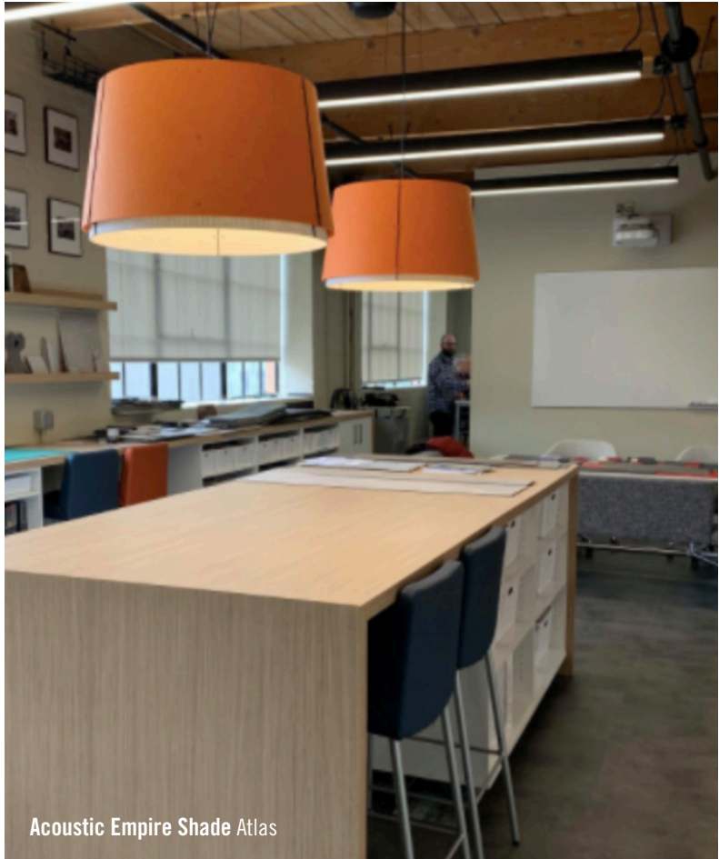
Acoustic Empire Shade Atlas