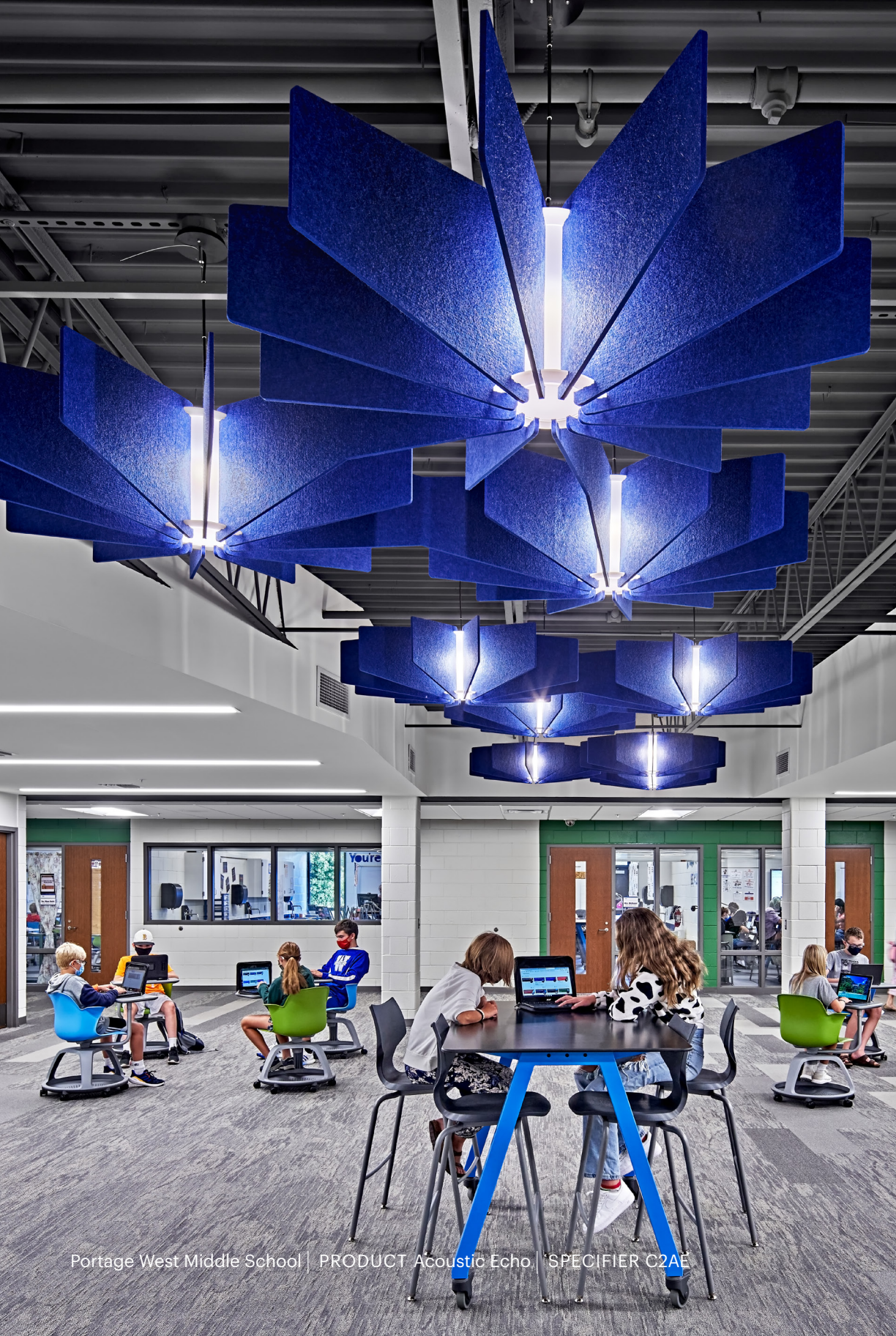
Portage West Middle School | PRODUCT Acoustic Echo | SPECIFIER C2AE