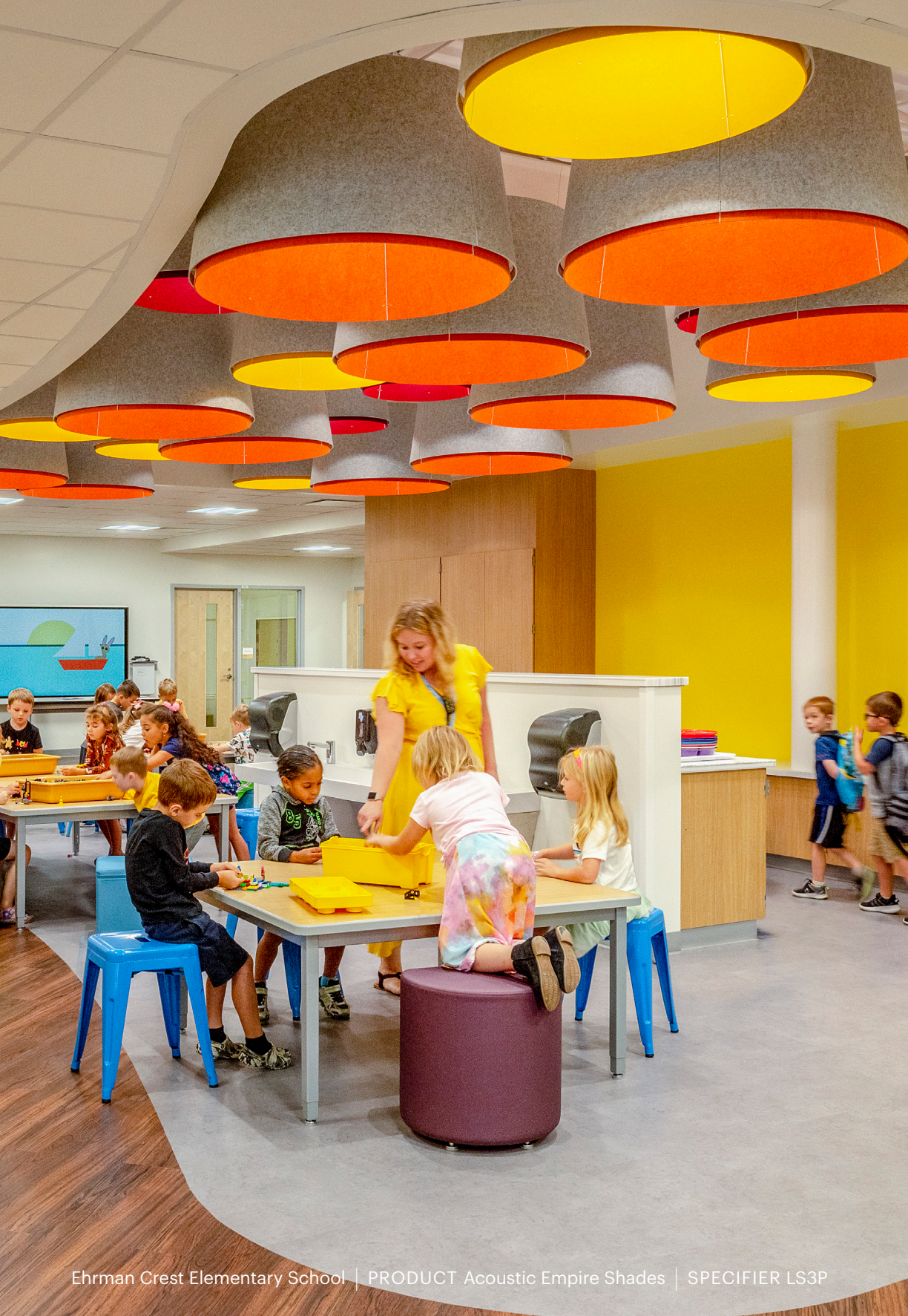
Ehrman Crest Elementary School | PRODUCT Acoustic Empire Shades | SPECIFIER LS3P