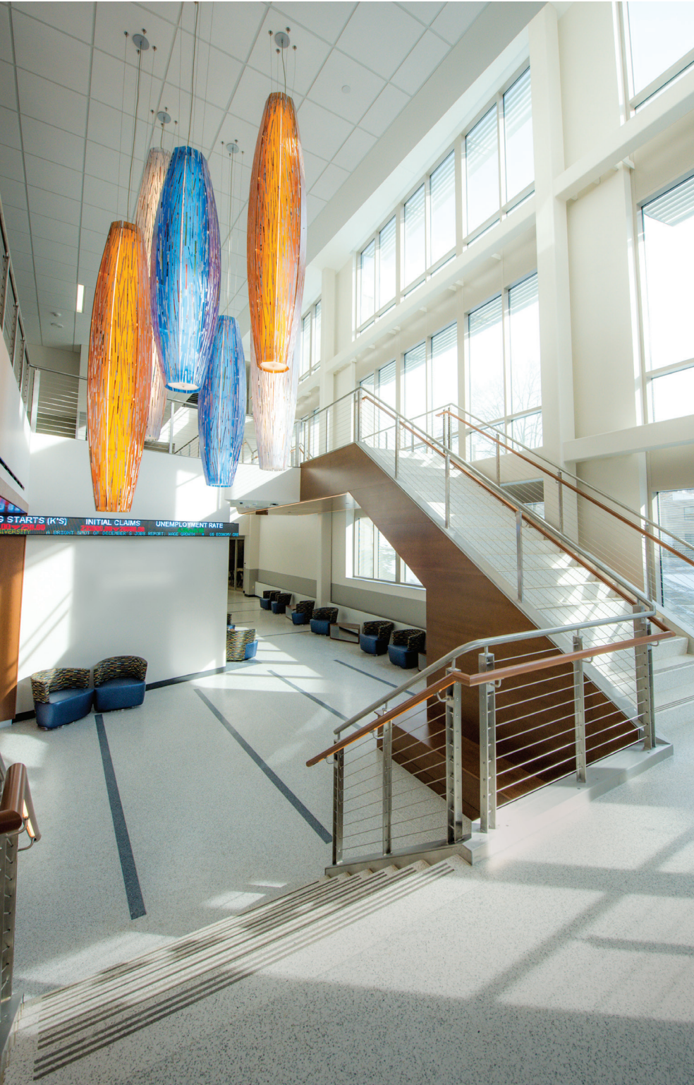
West Chester University | PRODUCT Cigar Pendants | SPECIFIER West Chester University