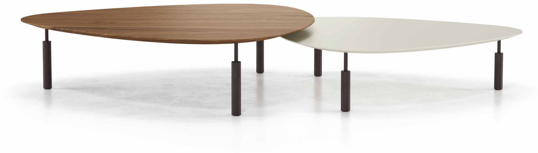
FINSBURY NESTING COFFEE TABLES