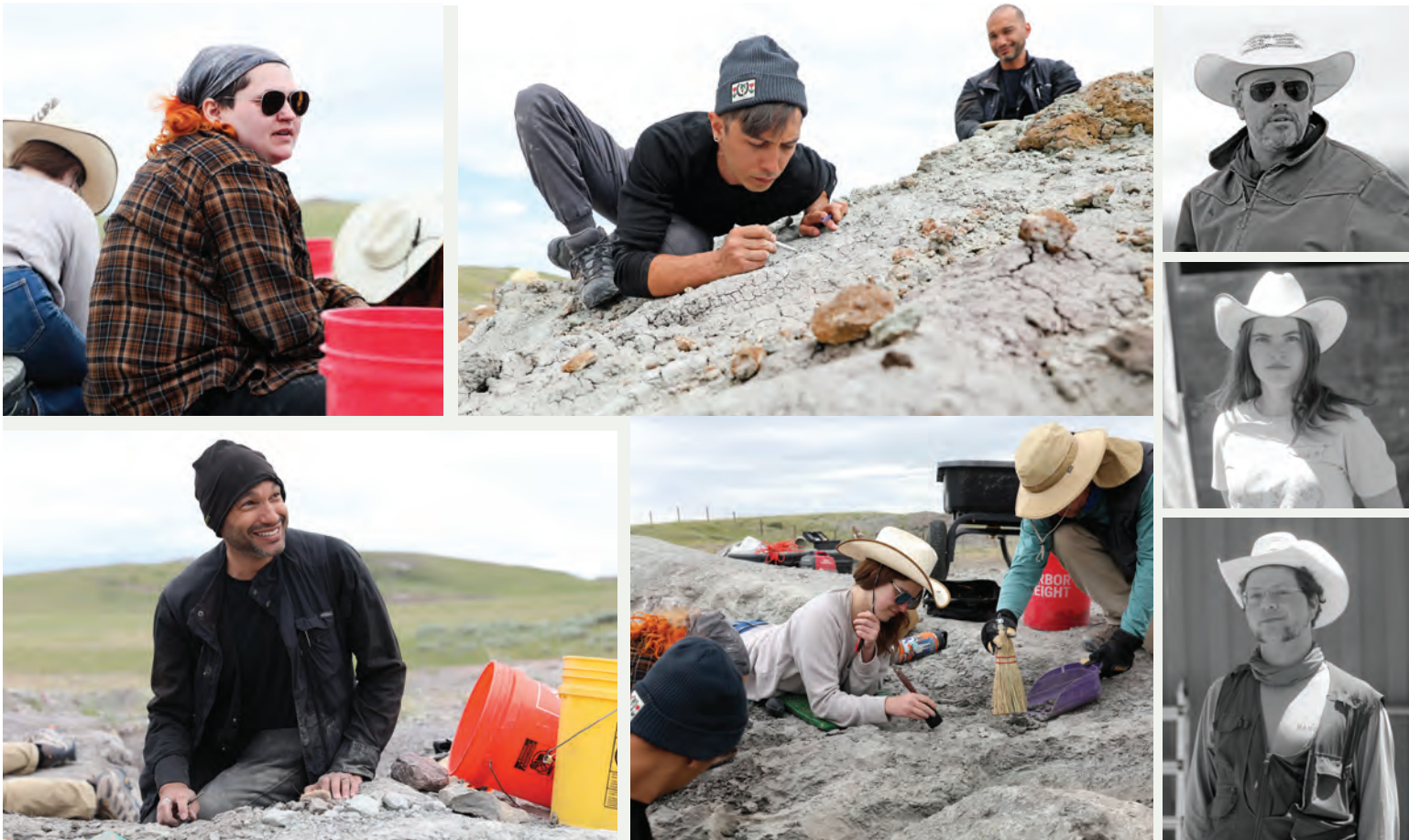
Egg Mountain, summer 2025.